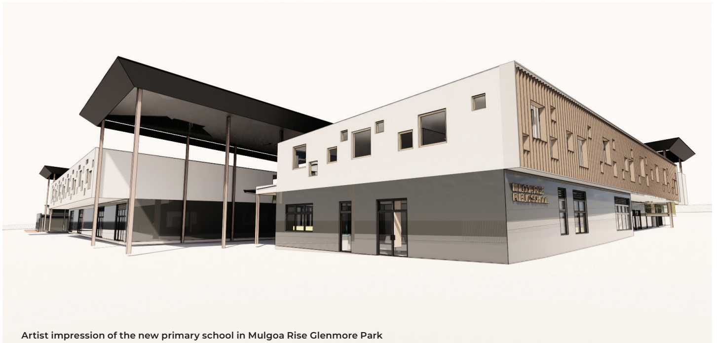
Artist impression of the new primary school in Mulgoa Rise Glenmore Park

You can also take a look at the construction impacts consent conditions and proposed action overleaf.