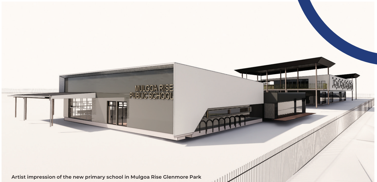
Artist impression of the new primary school in Mulgoa Rise Glenmore Park