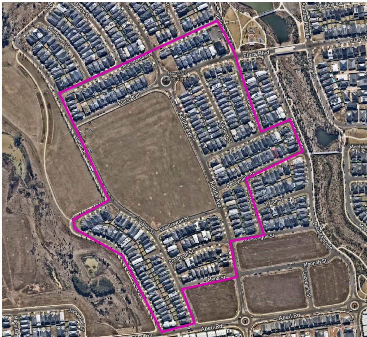
Figure 1: Map of construction works notification distribution area

The below details the nearest sensitive receivers that may be impacted by construction including noise. These stakeholders will receive notifications for unplanned out of hours works before undertaking the activities or as soon as is practical afterwards. This will also consider residents that may be impacted by heavy vehicle movements and other non-site specific impacts (e.g. truck movements).