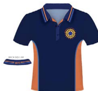
Sport polo shirt

The Melonba High School Facebook Page is live. The school will be posting ongoing updates as well as establishing its online community. Follow us on Facebook at facebook.com/MelonbaHS .