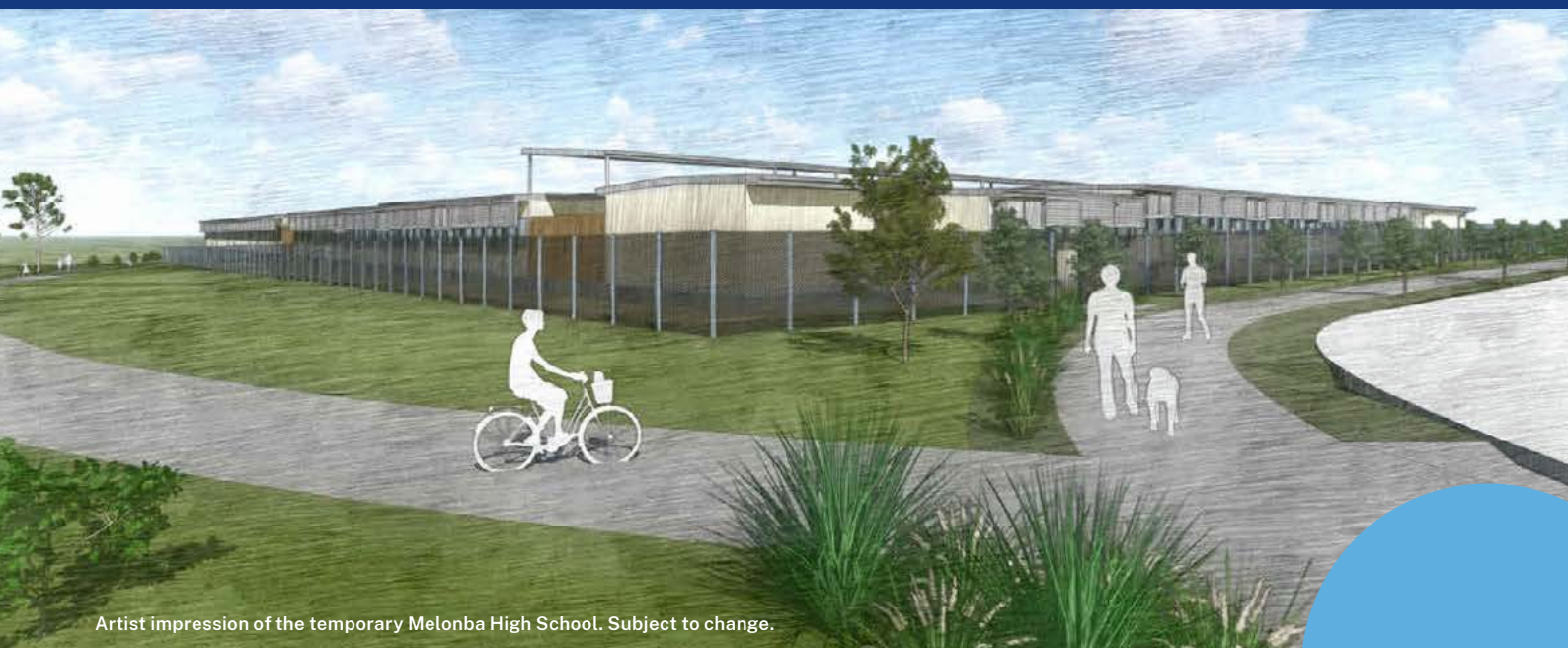
Artist impression of the temporary Melonba High School. Subject to change.