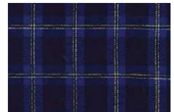
Tartan skirt as an example, design to come