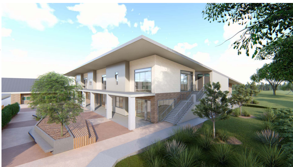
Artist impression of the new building in U Block

For the latest information, visit the project web page: https://www.schoolinfrastructure.nsw.gov.au/projects/m/muswellbrook-south-public-school-upgrade.html