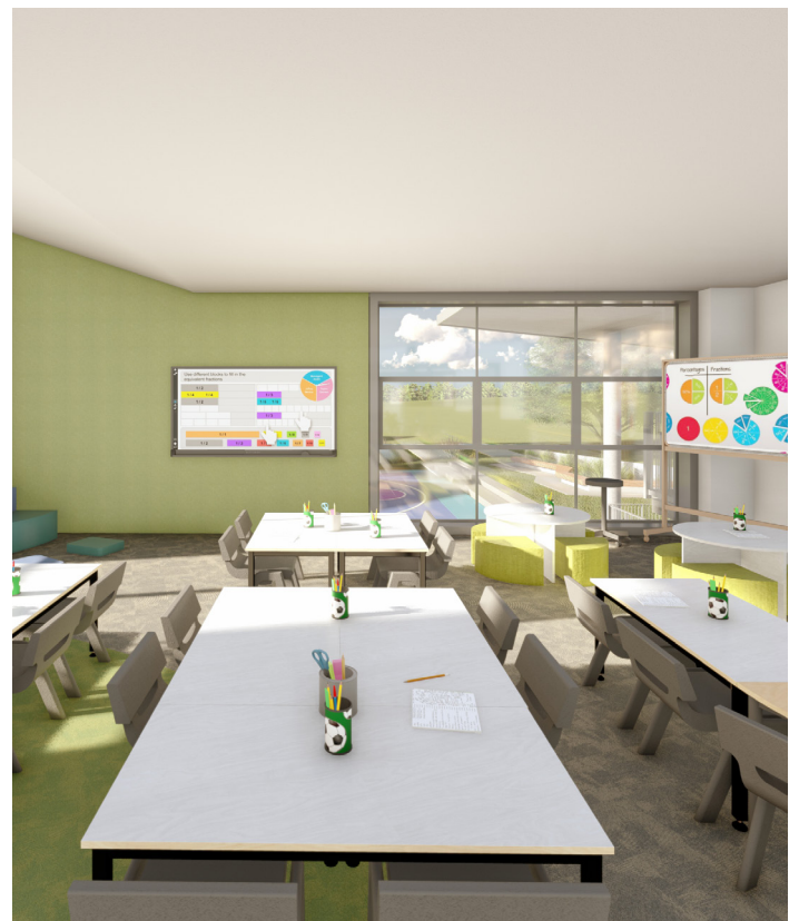
Artist impression of a flexible learning space

Flexibility helps teachers provide a broad range of learning experiences. The spaces help empower students to learn at their own pace and support their learning in different ways. Designed with students at the centre, effective learning spaces allow for teaching that suits individual needs and interests.