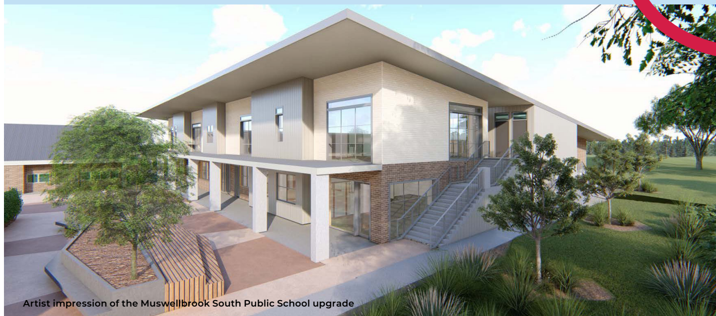
Artist impression of the Muswellbrook South Public School upgrade

The NSW Government is investing $7.9 billion over the next four years, continuing its program to deliver 215 new and upgraded schools to support communities across NSW. This is the largest investment in public education infrastructure in the history of NSW.