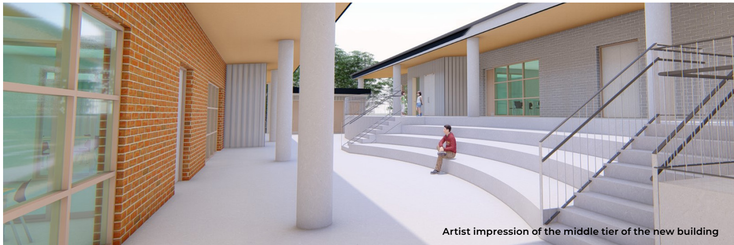
Artist impression of the middle tier of the new building