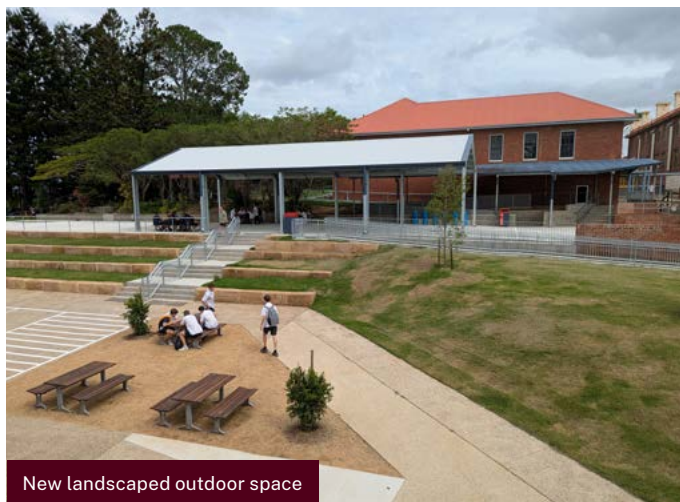
New landscaped outdoor space