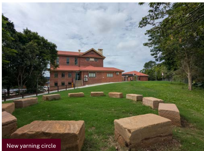
New yarning circle