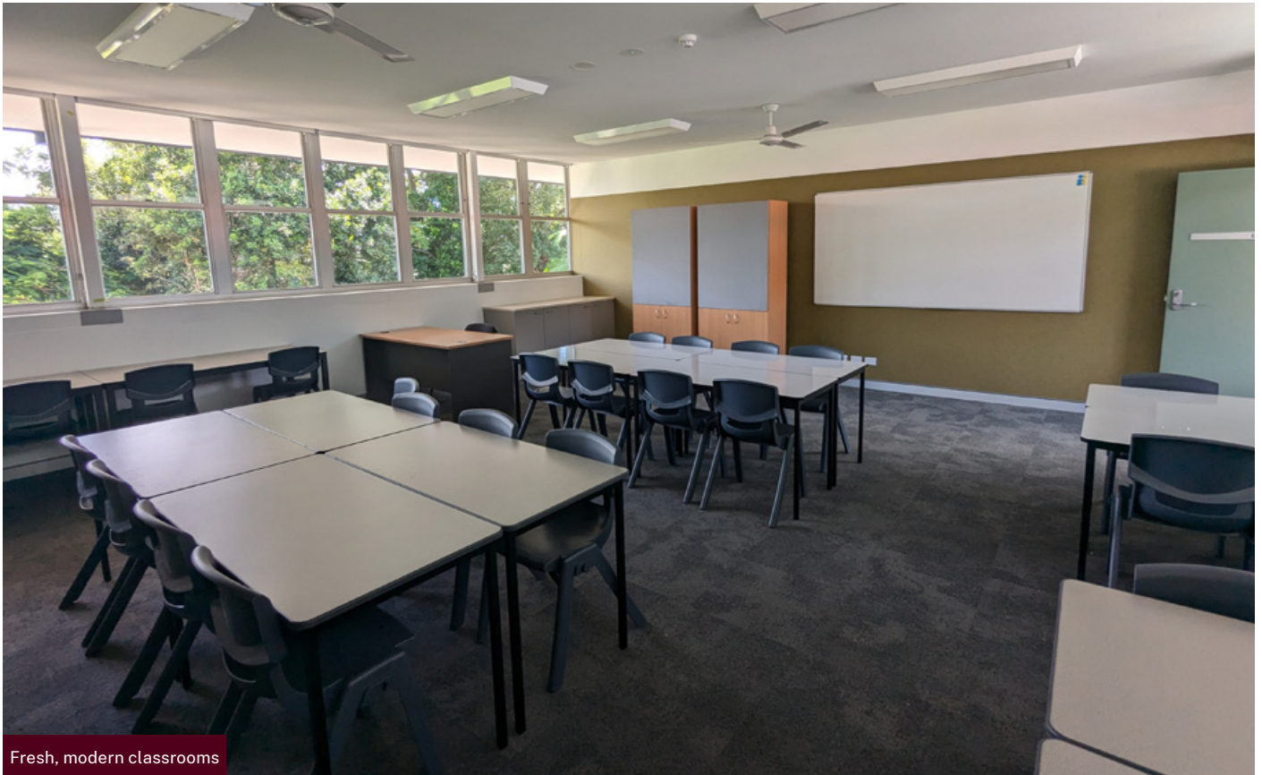
Fresh, modern classrooms