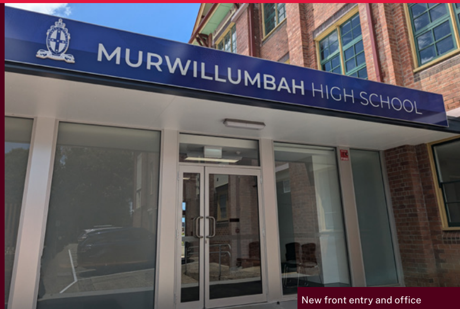
New front entry and office