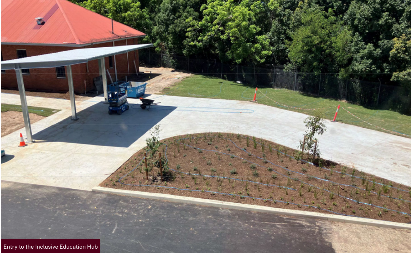
Entry to the Inclusive Education Hub