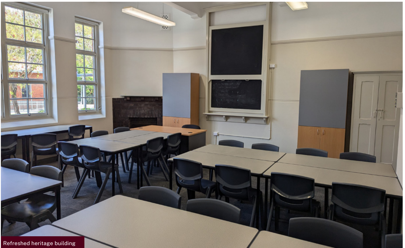
Refreshed heritage building