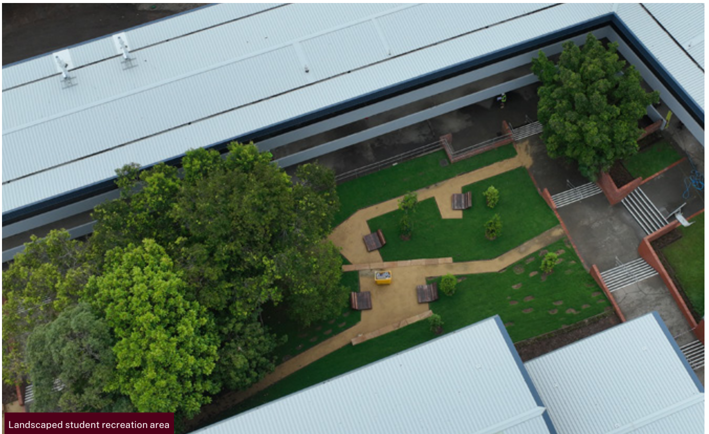
Landscaped student recreation area