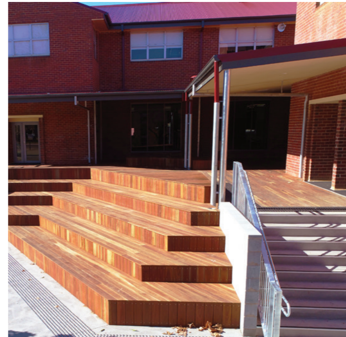
Outdoor learning spaces at the Griffith site

New facilities such the upgraded library, tiered learning areas and senior study spaces will provide positive learning environments, that will in return build confidence in all areas of our student's school life.