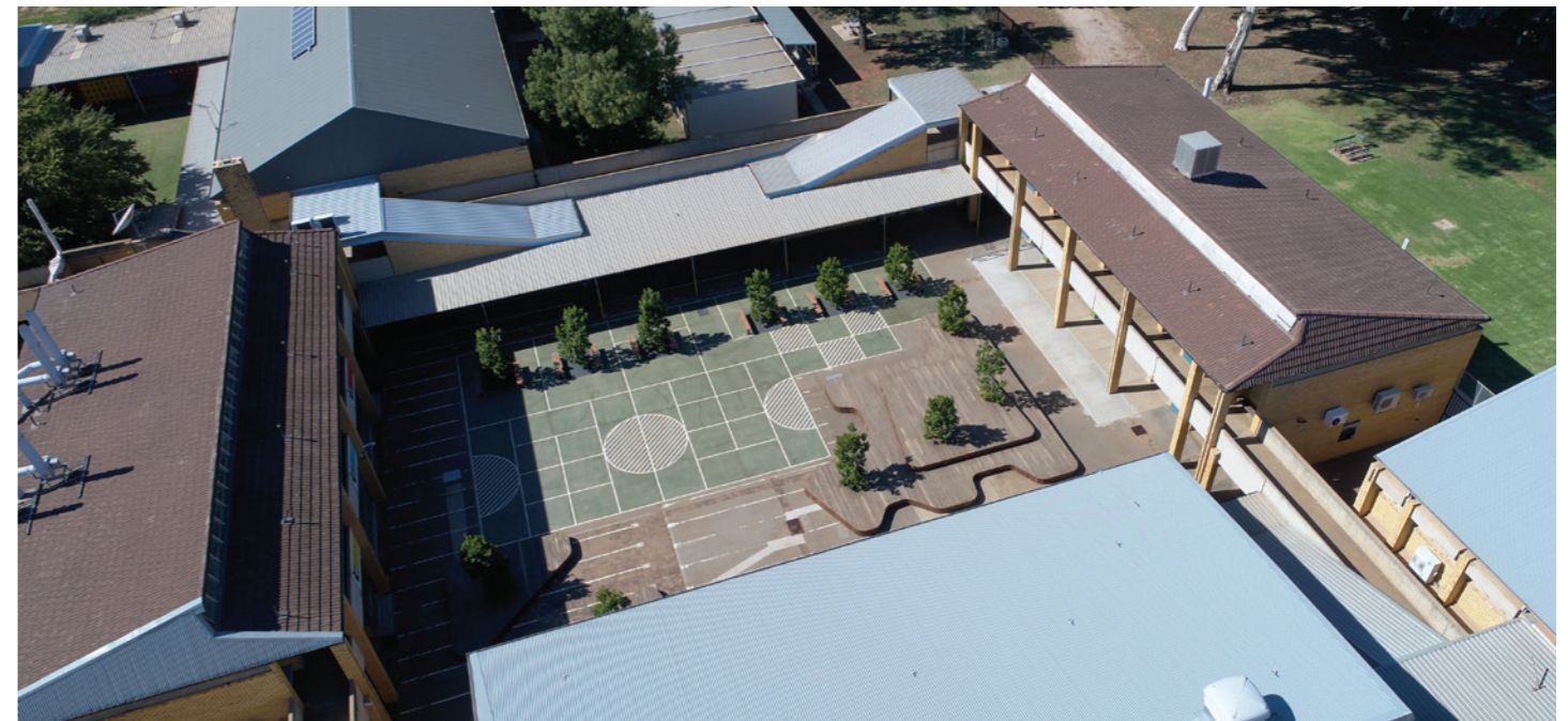
New outdoor decking area, landscaping and outdoor furniture on Wade site