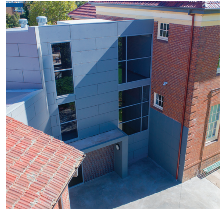
New vertical circulation hub, including elevator at the Griffith site