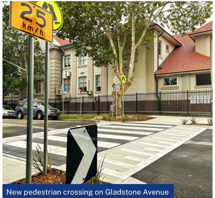
New pedestrian crossing on Gladstone Avenue