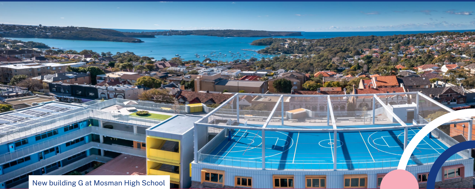
New building G at Mosman High School