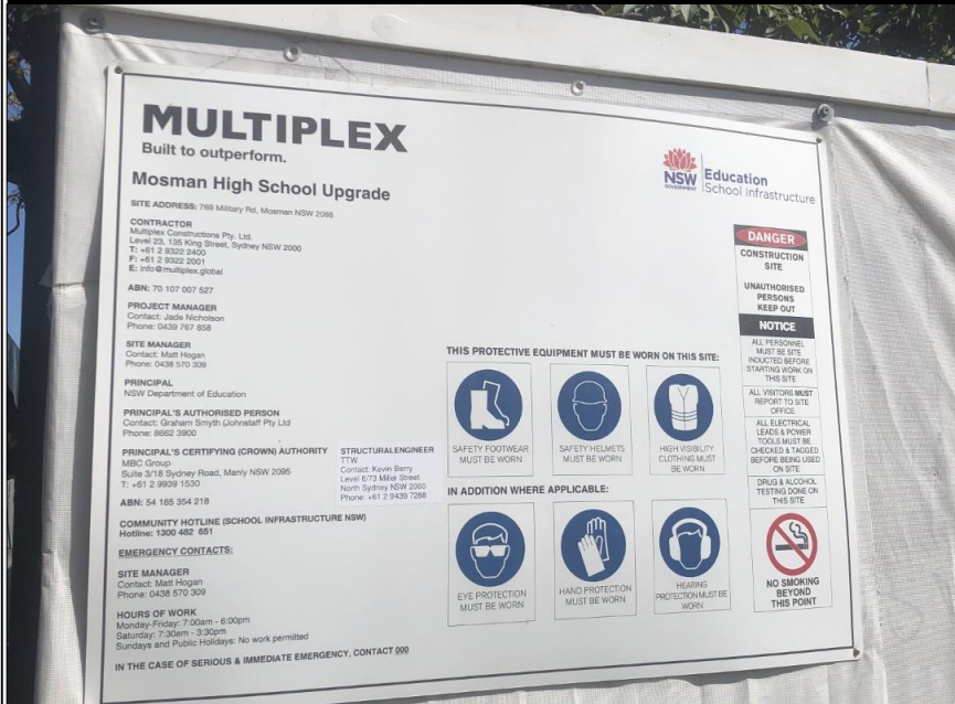
PHOTOGRAPH 1: SIGNAGE ON SITE BOUNDARY