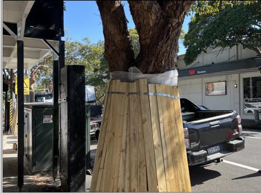
PHOTOGRAPH 6: TREE PROTECTION MEASURES