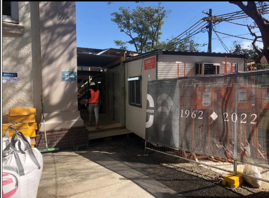
PHOTOGRAPH 3: SITE COMPOUND