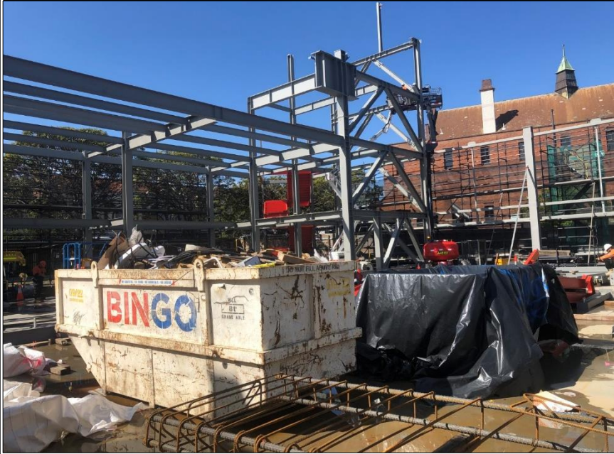
PHOTOGRAPH 5: WASTE STORAGE ON SITE