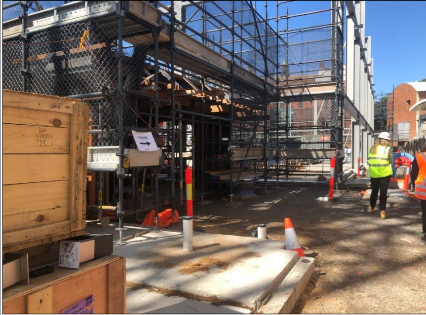
PHOTOGRAPH 7: CONSTRUCTION AREA