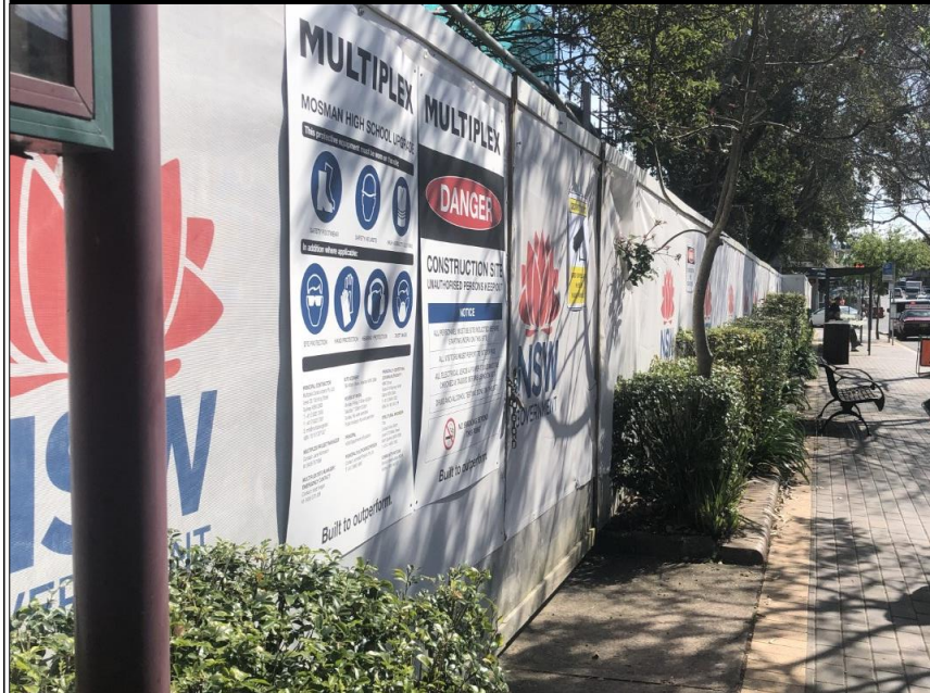
PHOTOGRAPH 2: CONSTRUCTION HOARDING/FENCING