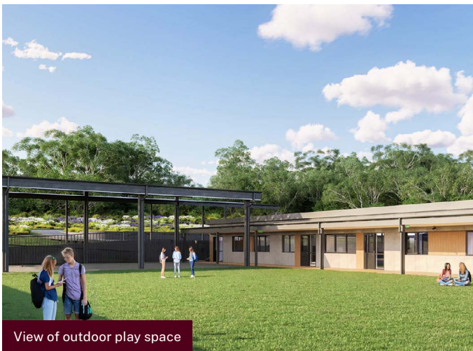
View of outdoor play space