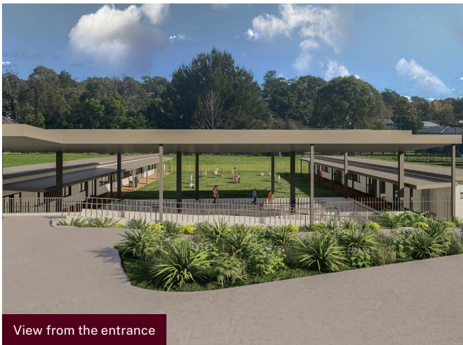
View from the entrance