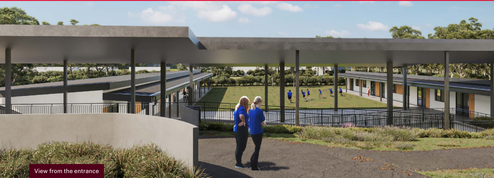
View from the entrance