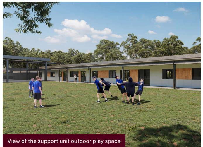
View of the support unit outdoor play space