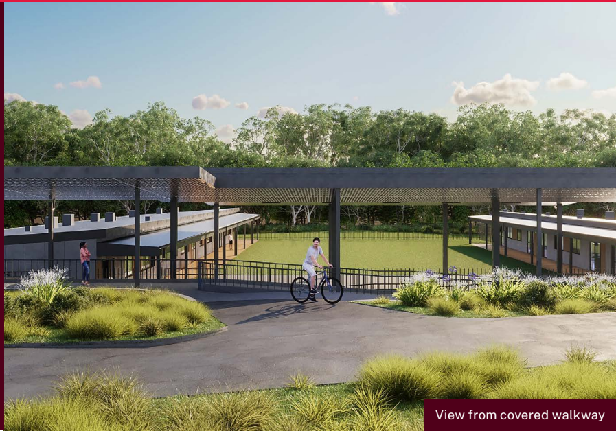
View from covered walkway

The upgrade of Moruya High School will replace the temporary facilities currently used for the support unit with new permanent facilities.