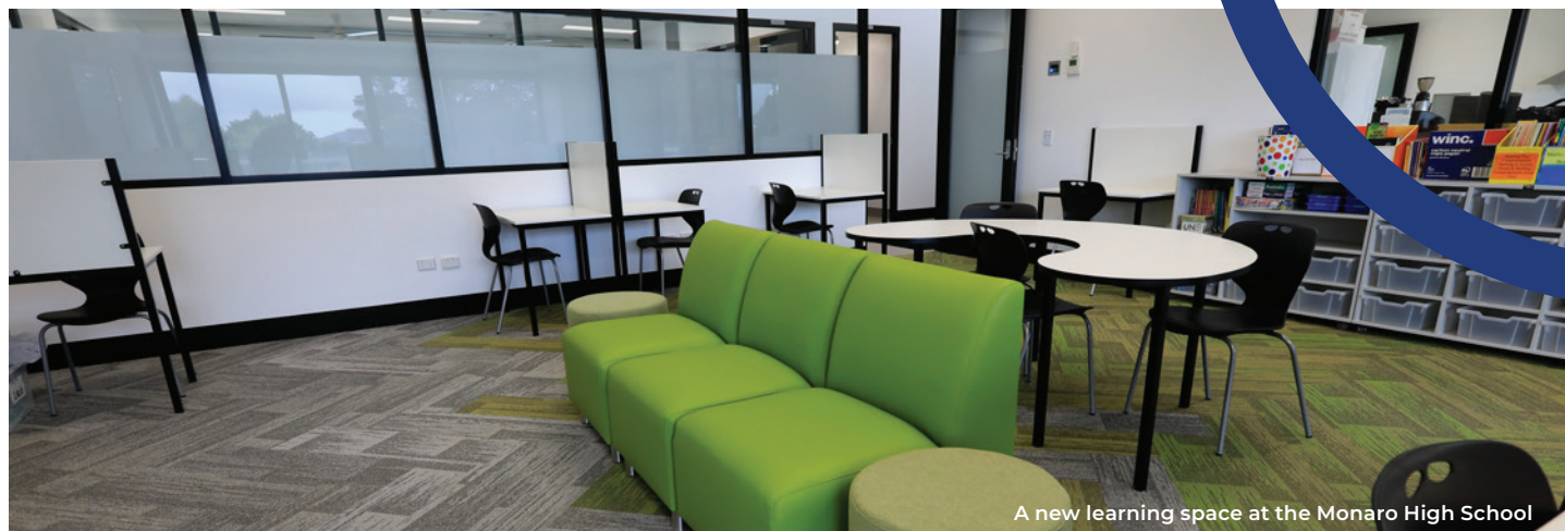
A new learning space at the Monaro High School