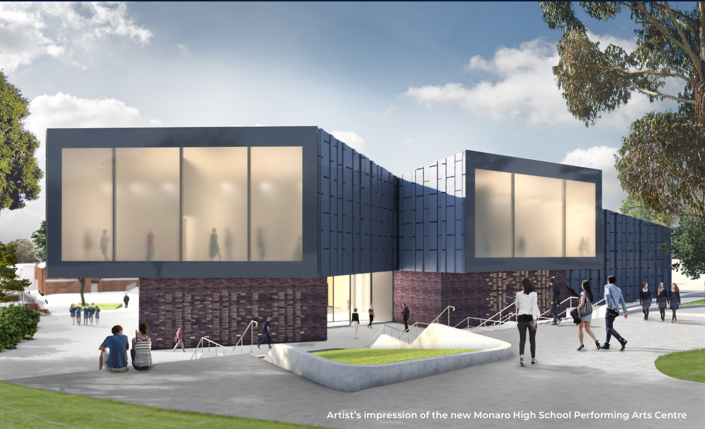
Artist’s impression of the new Monaro High School Performing Arts Centre

THE LARGEST INVESTMENT IN PUBLIC SCHOOL EDUCATION INFRASTRUCTURE IN THE HISTORY OF NSW