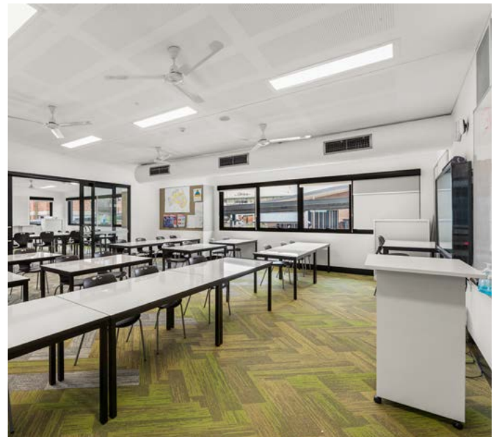
New flexible learning spaces