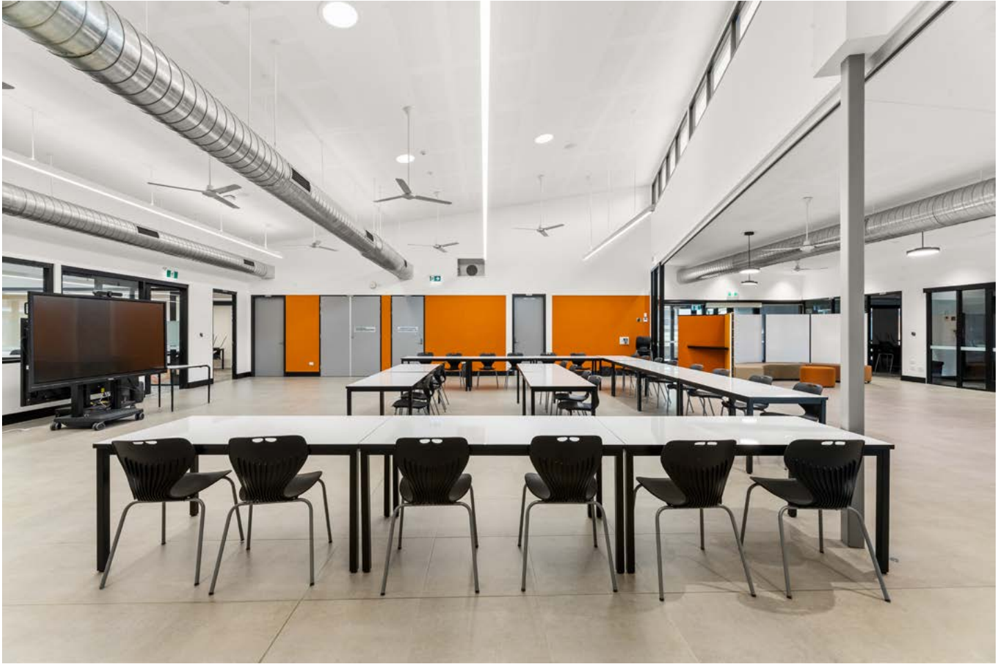
Inside the new innovation hub