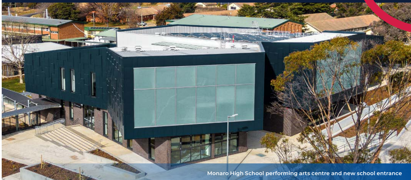
Monaro High School performing arts centre and new school entrance

We recently completed the final works for the Monaro High School upgrade. These works included the refurbishment of Building B South and landscaping.