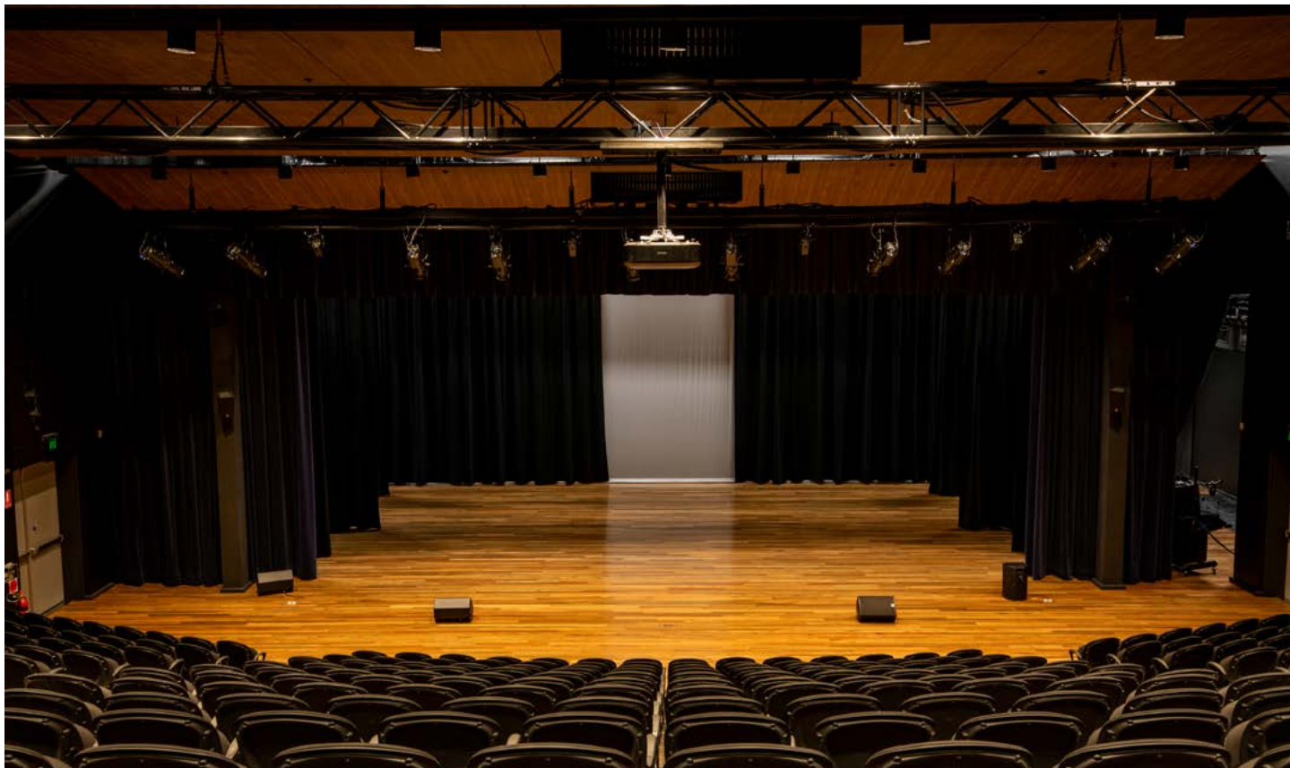
The new 350 capacity theatre in the performing arts centre