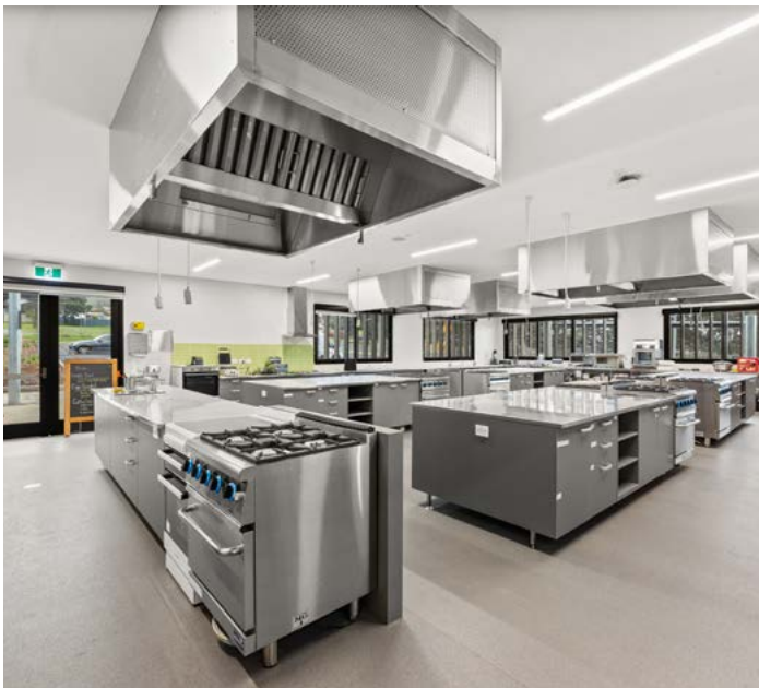
New semi-commercial kitchen