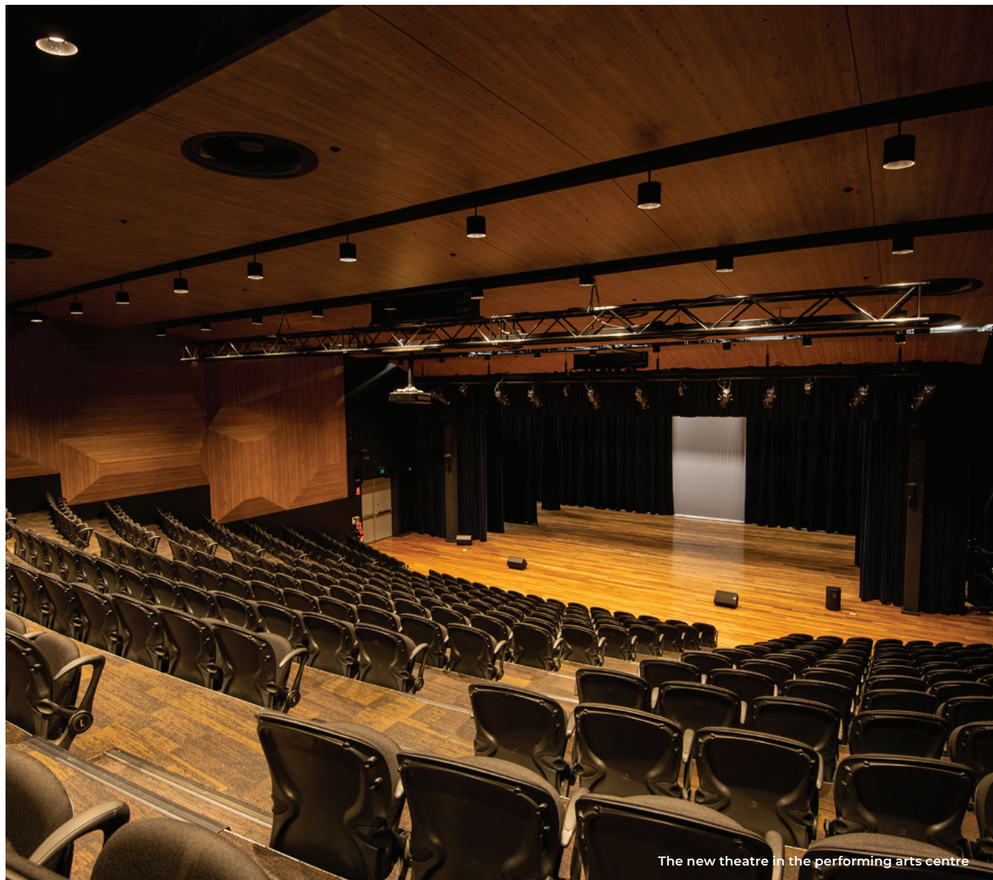
The new theatre in the performing arts centre