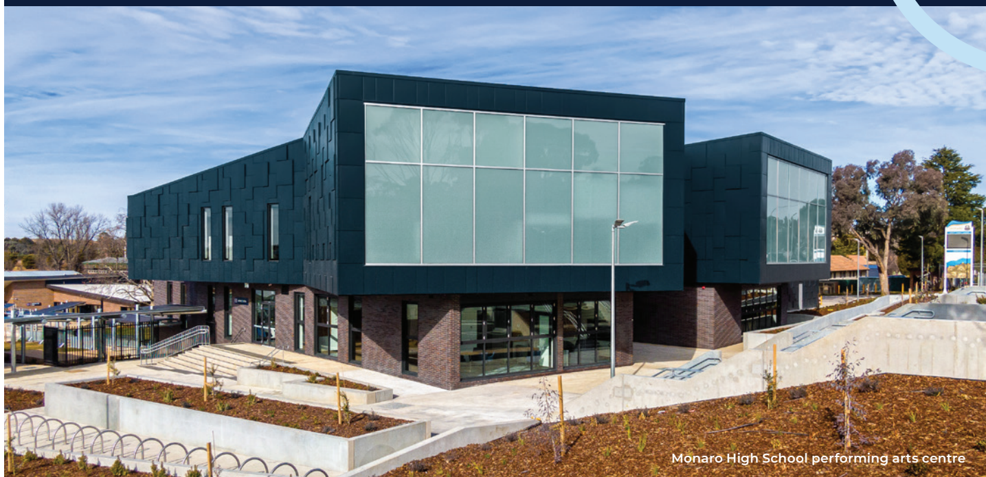
Monaro High School performing arts centre