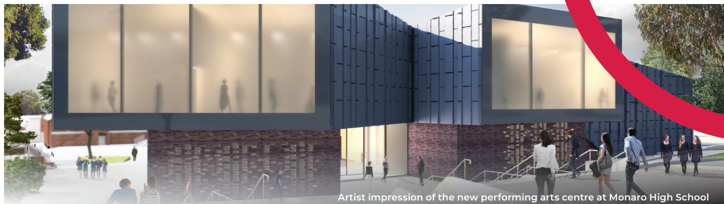
Artist impression of the new performing arts centre at Monaro High School