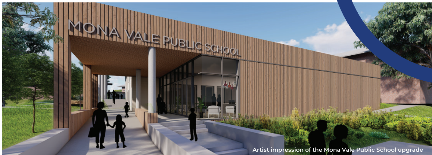
Artist impression of the Mona Vale Public School upgrade