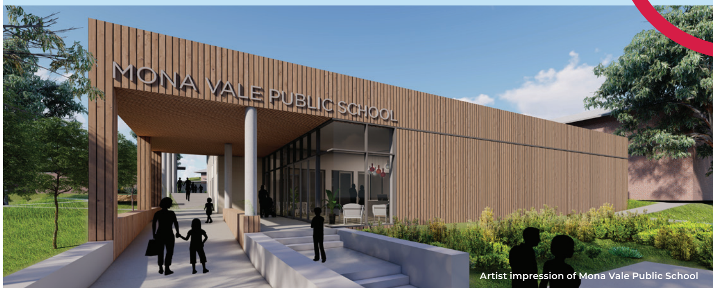
Artist impression of Mona Vale Public School

The NSW Government is investing $7 billion over the next four years, continuing its program to deliver more than 200 new and upgraded schools to support communities across NSW. This is the largest investment in public education infrastructure in the history of NSW.