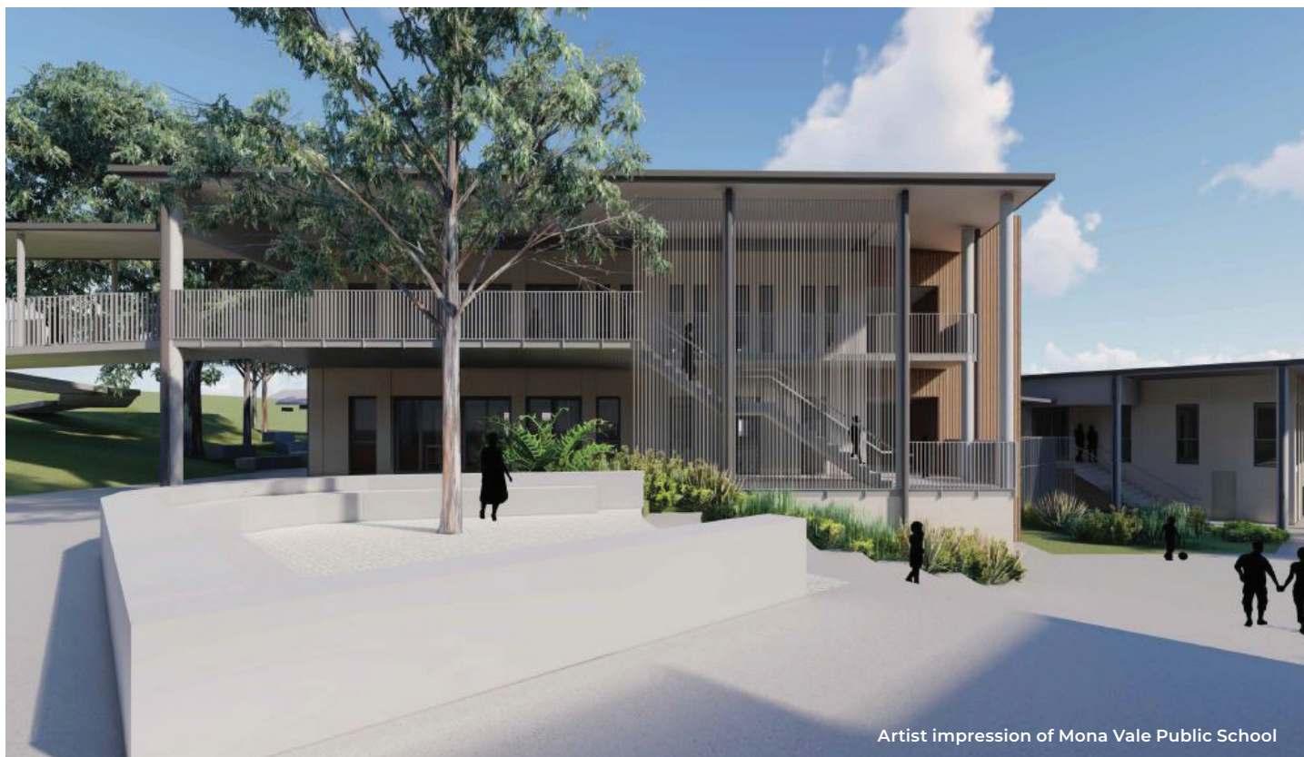
Artist impression of Mona Vale Public School

For more information, questions or to make a comment please email us at schoolinfrastructure@det.nsw.edu.au or phone 1300 482 651. The health and safety of our students, staff and community are our priority.