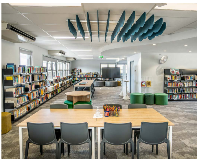
Refurbished library in Block A at Mona Vale Public School