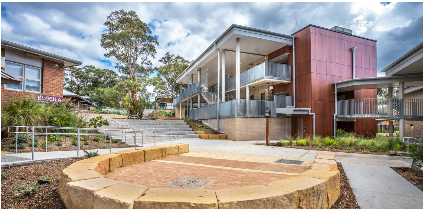
The school's heritage pavers outside the new Block R and upgraded Block A at Mona Vale Public School