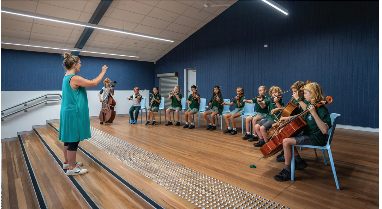
Students and staff using the refurbished hall at Mona Vale Public School