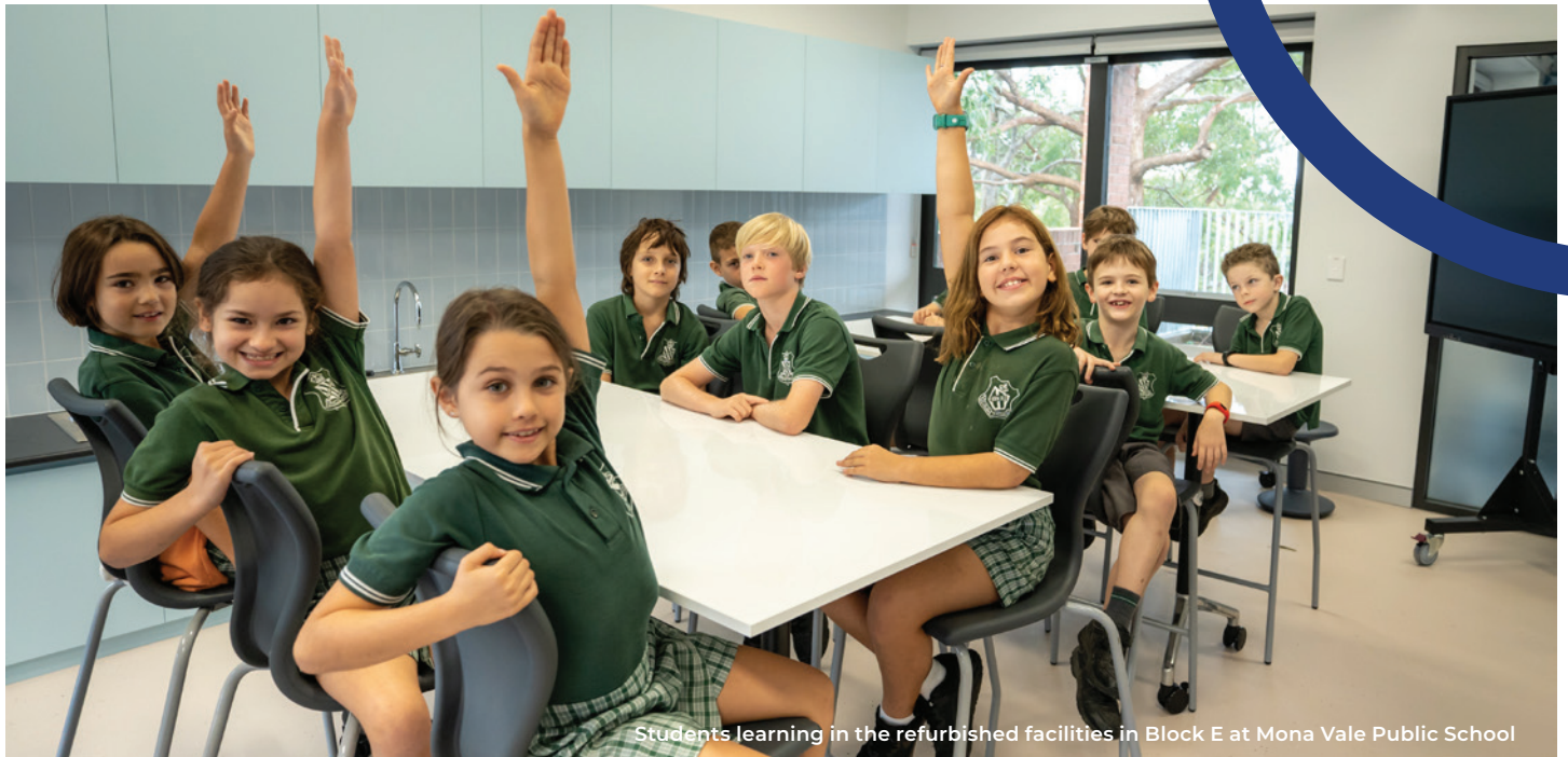
Students learning in the refurbished facilities in Block E at Mona Vale Public School