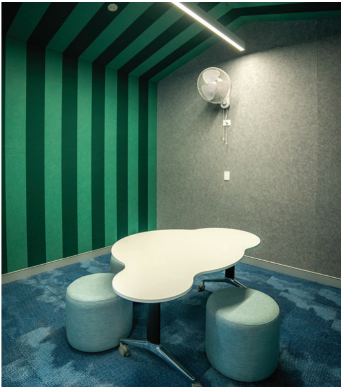
Refurbished learning space in Block E at Mona Vale Public School