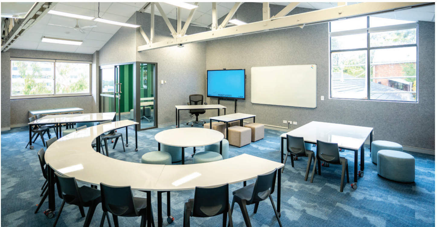
Refurbished learning space in Block E at Mona Vale Public School

Construction work hours are Monday to Saturday, 7:00 am to 6:00 pm. No work will be undertaken on Sunday or on public holidays.