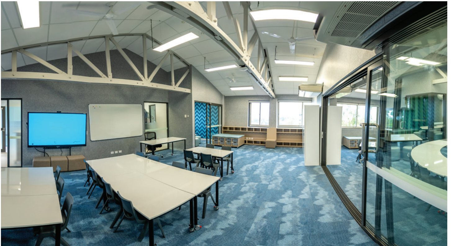
Refurbished learning spaces in Block E at Mona Vale Public School