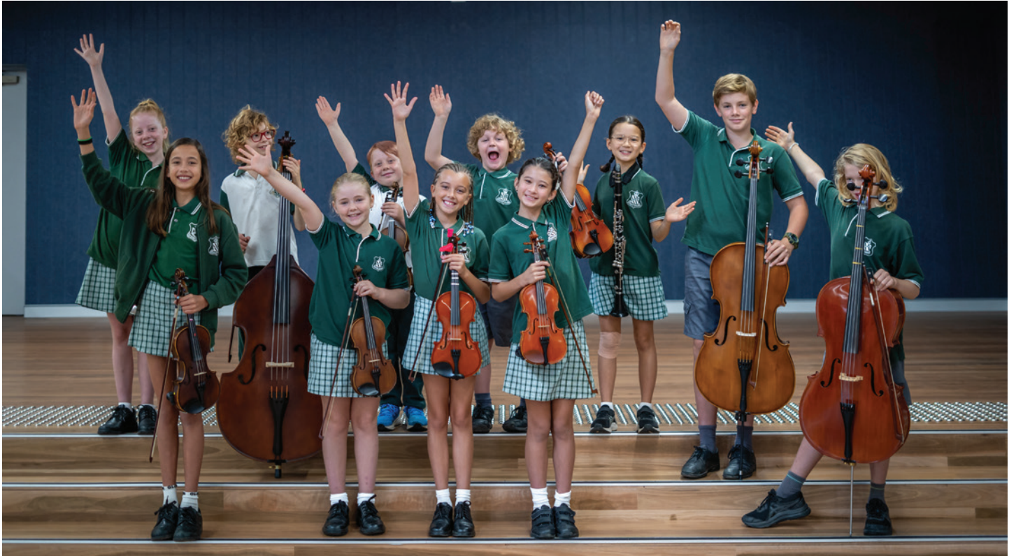
Students enjoying the refurbished hall at Mona Vale Public School