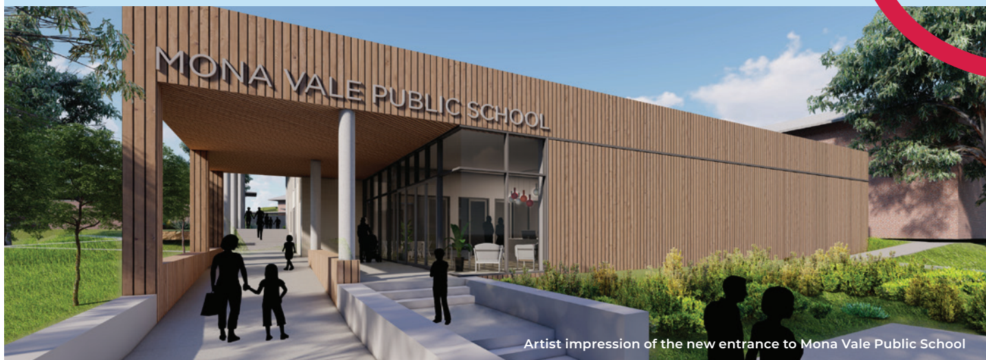
Artist impression of the new entrance to Mona Vale Public School

The NSW Government is investing $8.6 billion in school infrastructure over the next four years, continuing its program to deliver 160 new and upgraded schools to support communities across NSW. This builds on the more than $9.1 billion invested in projects delivered since 2017, a program of $17.7 billion in public education infrastructure.