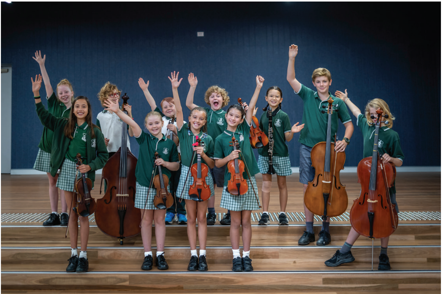
Students enjoying the new hall at Mona Vale Public School