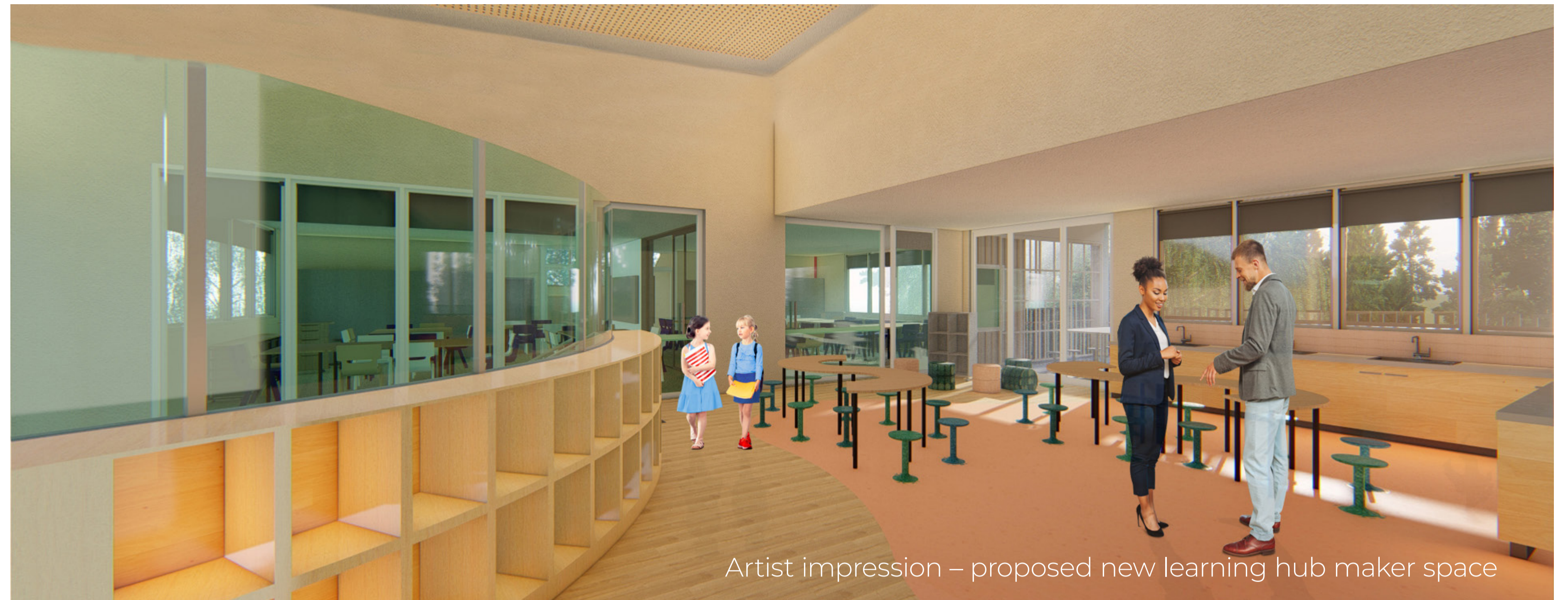
Artist impression – proposed new learning hub maker space