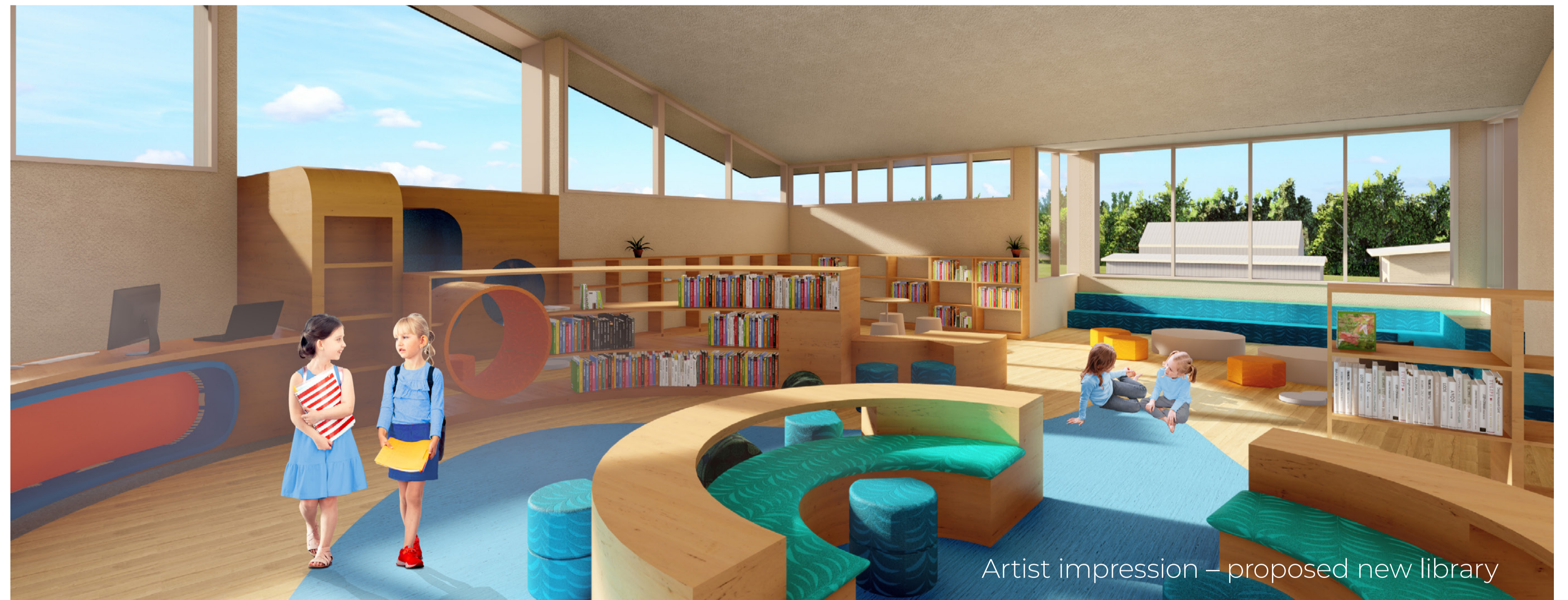
Artist impression – proposed new library