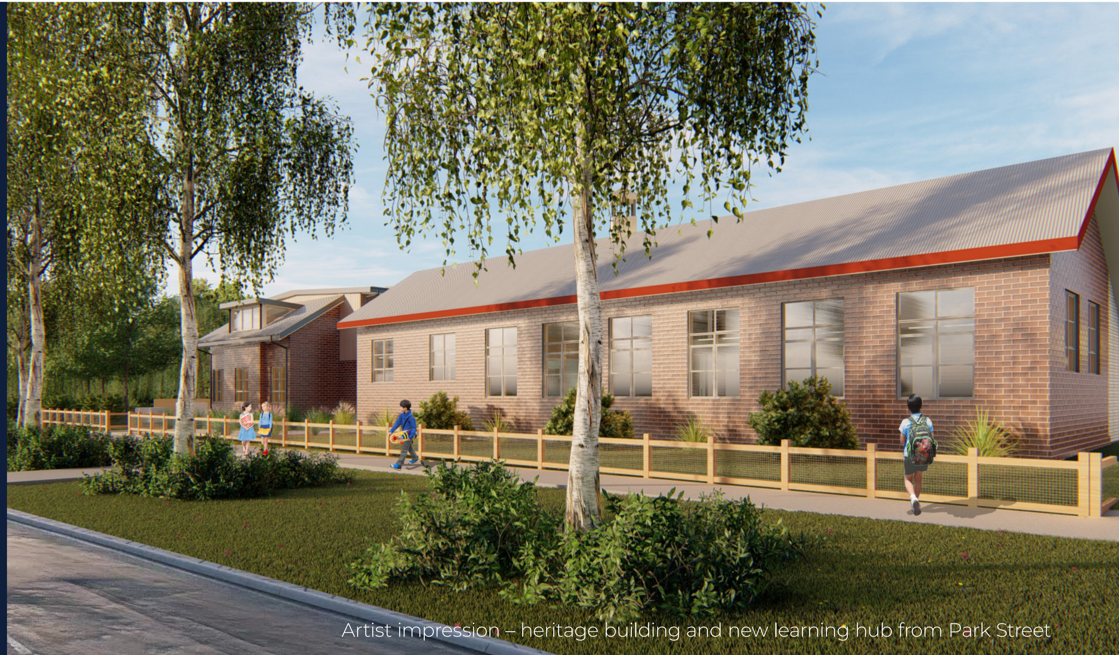
Artist impression – heritage building and new learning hub from Park Street