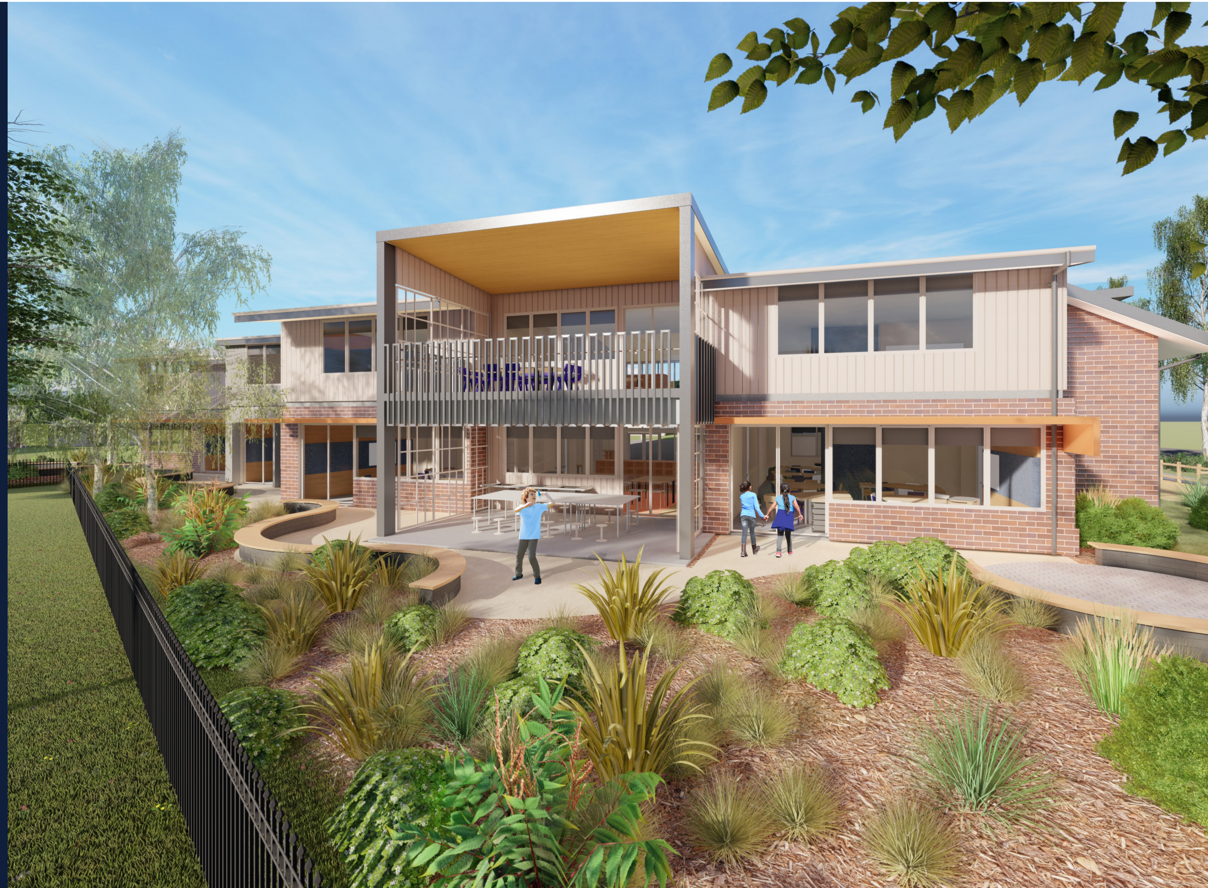
Artist impression – proposed new learning hub from the North