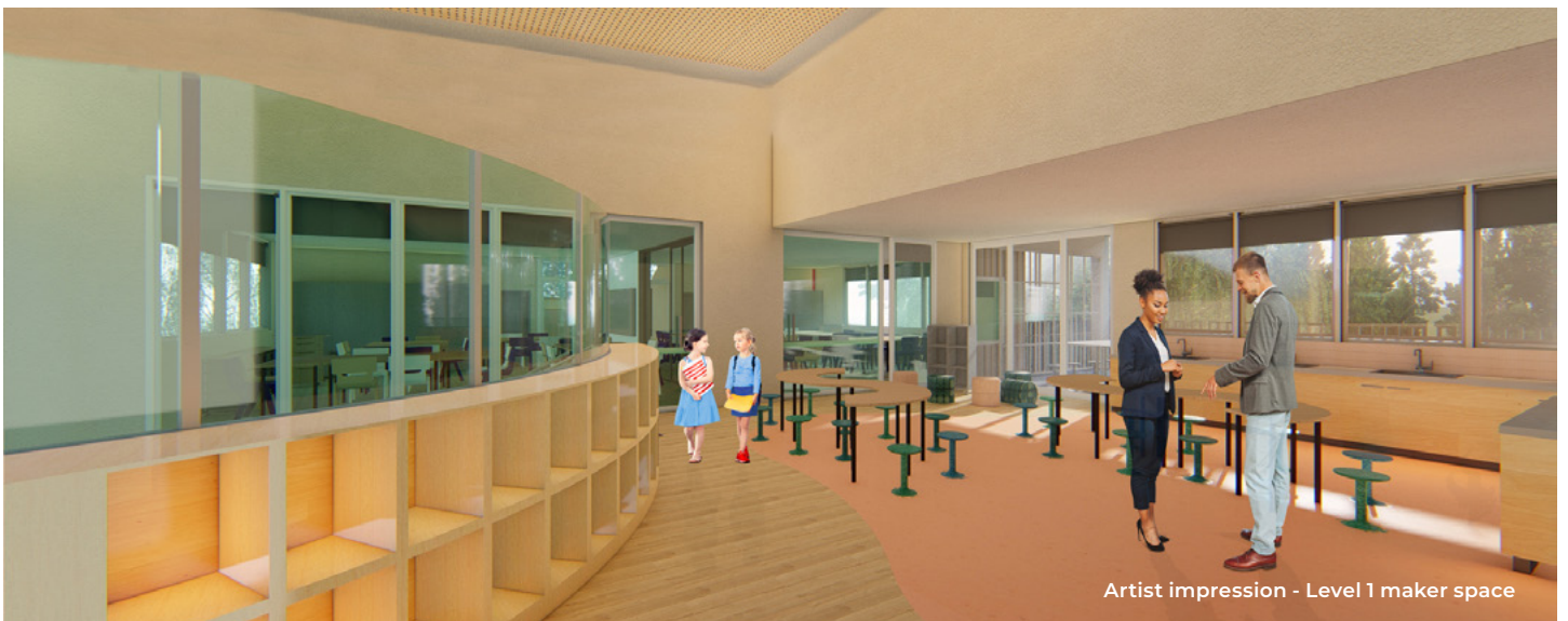
Artist impression - Level 1 maker space