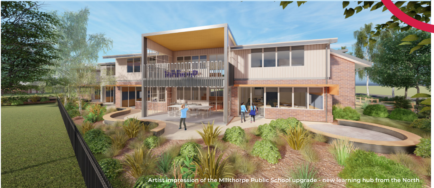
Artist impression of the Millthorpe Public School upgrade - new learning hub from the North

The NSW Government is investing $7 billion over the next four years, continuing its program to deliver more than 200 new and upgraded schools to support communities across NSW. This is the largest investment in public education infrastructure in the history of NSW.