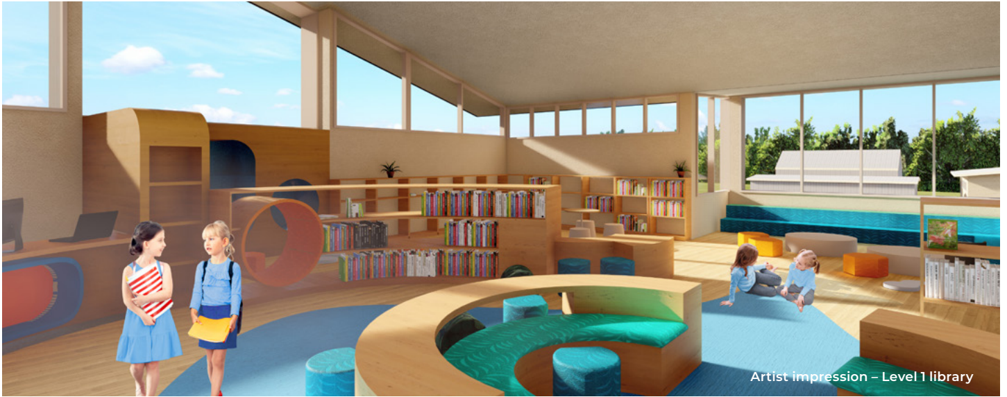
Artist impression – Level 1 library