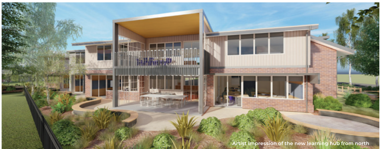
Artist impression of the new learning hub from north