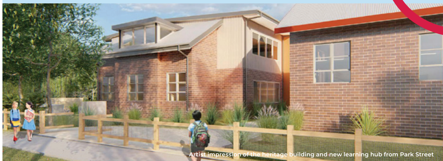
Artist impression of the heritage building and new learning hub from Park Street

The NSW Government is investing $7.9 billion over the next four years, continuing its program to deliver 215 new and upgraded schools to support communities across NSW. This is the largest investment in public education infrastructure in the history of NSW.