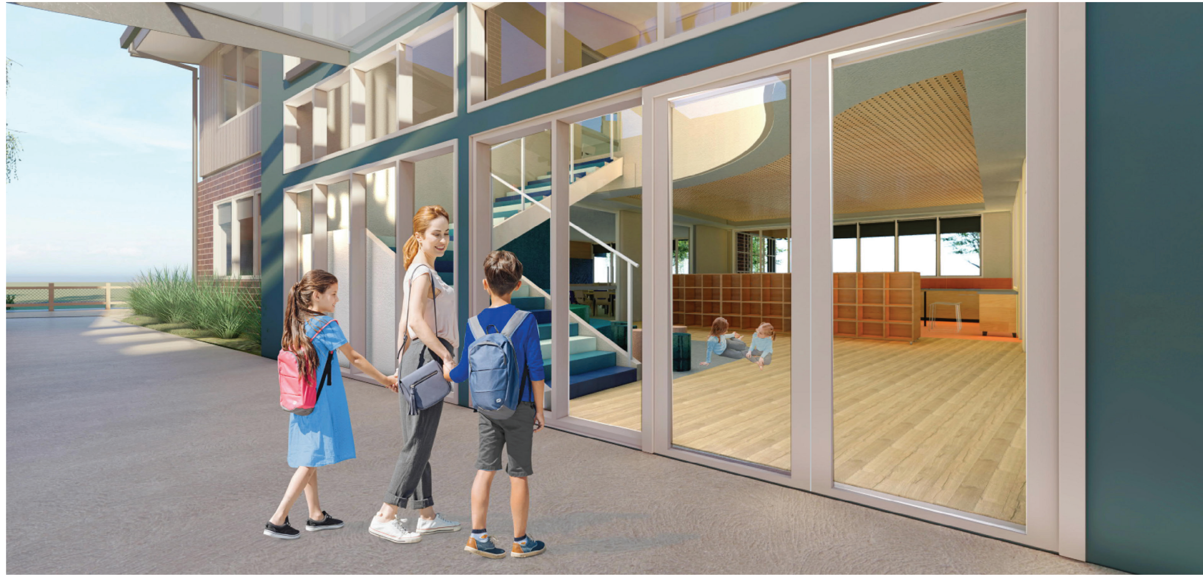
Artist impression of the entry space