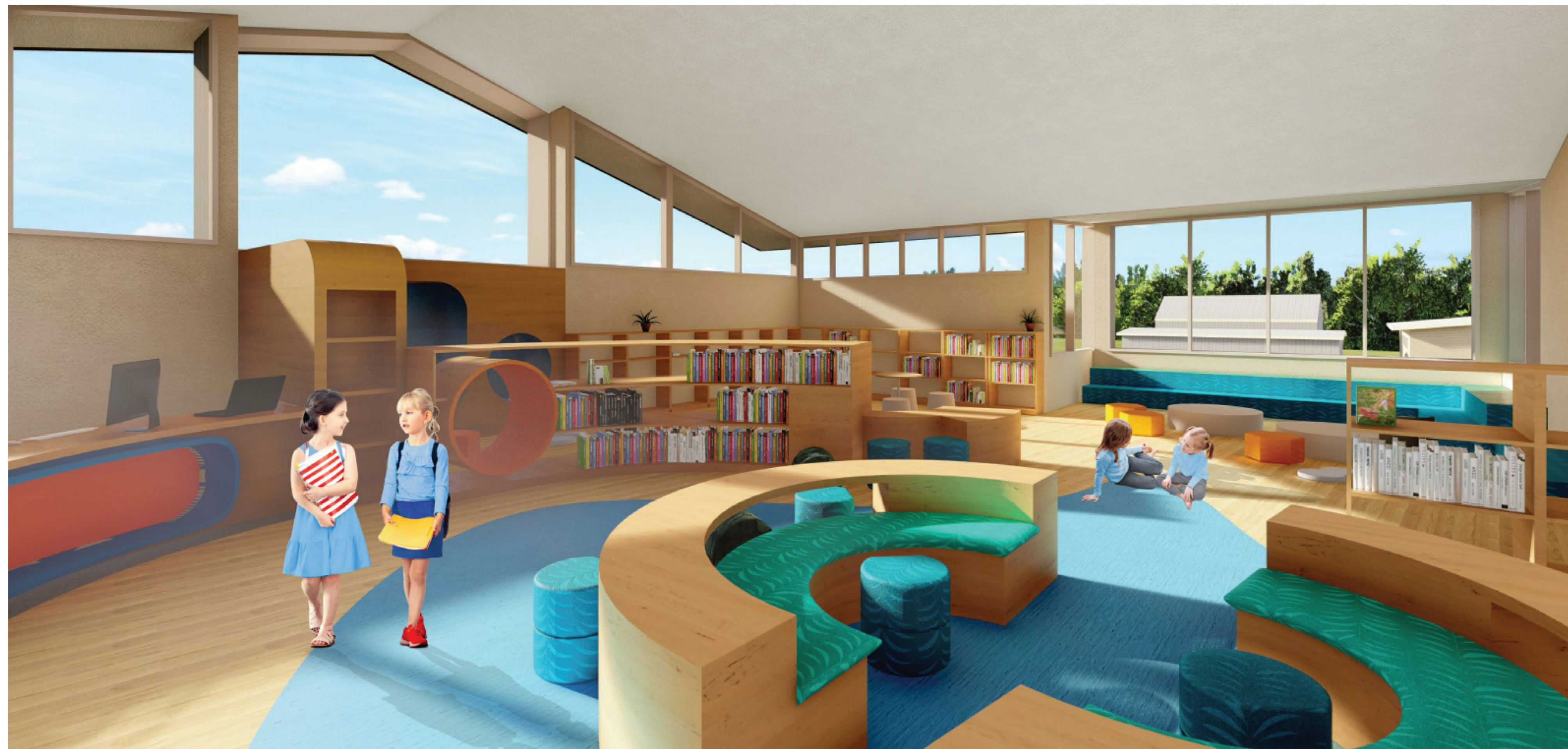
Artist impression of the level one library