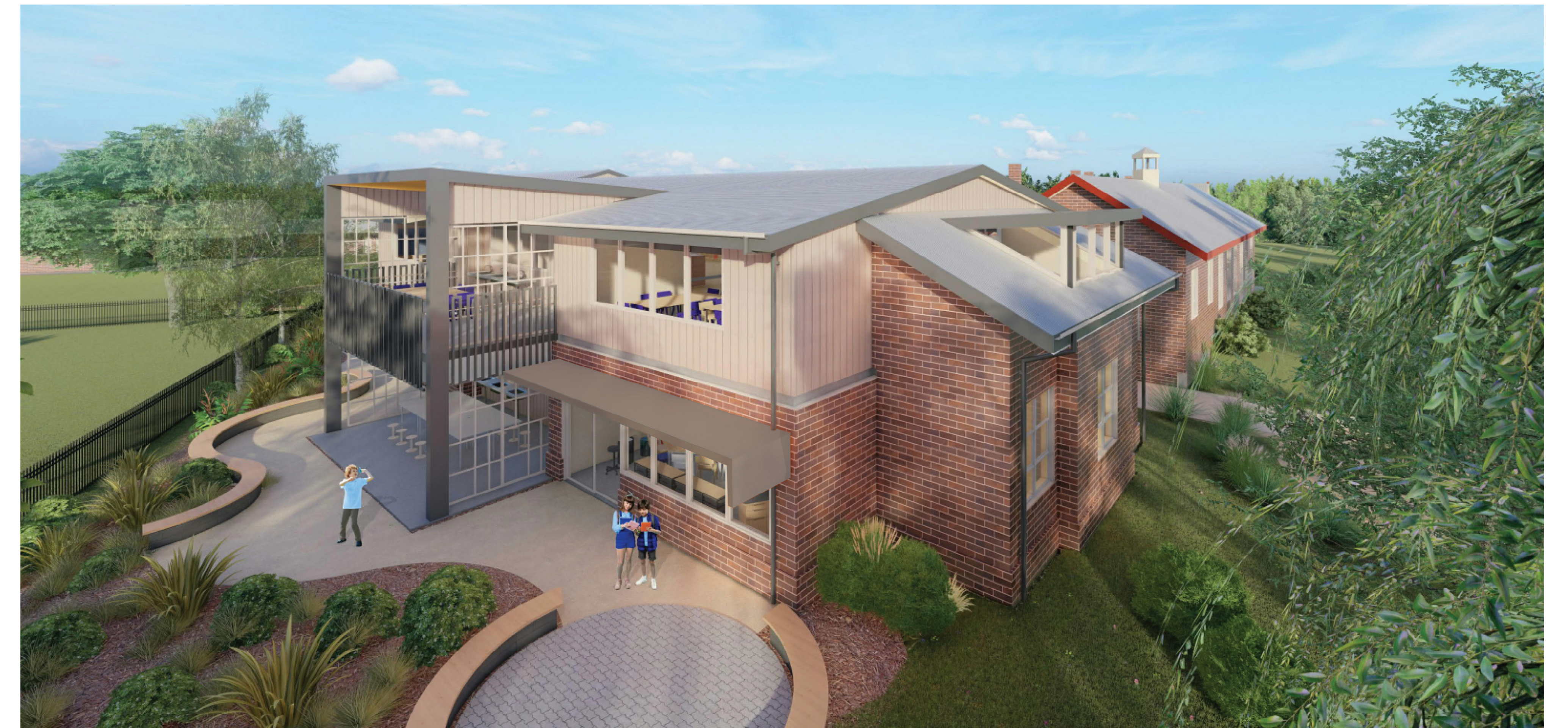
Artist impression of the new learning hub from the north west