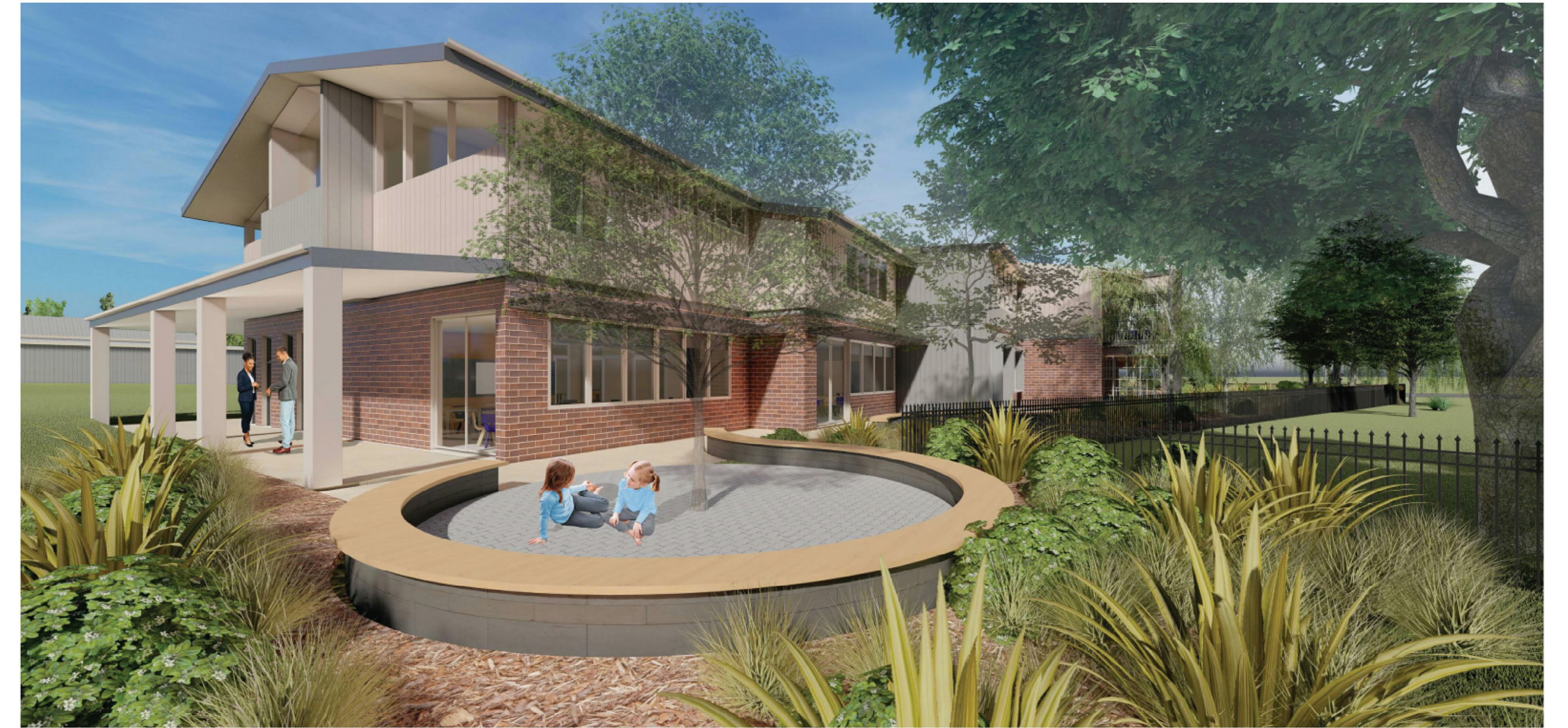
Artist impression of the new learning hub from the north east