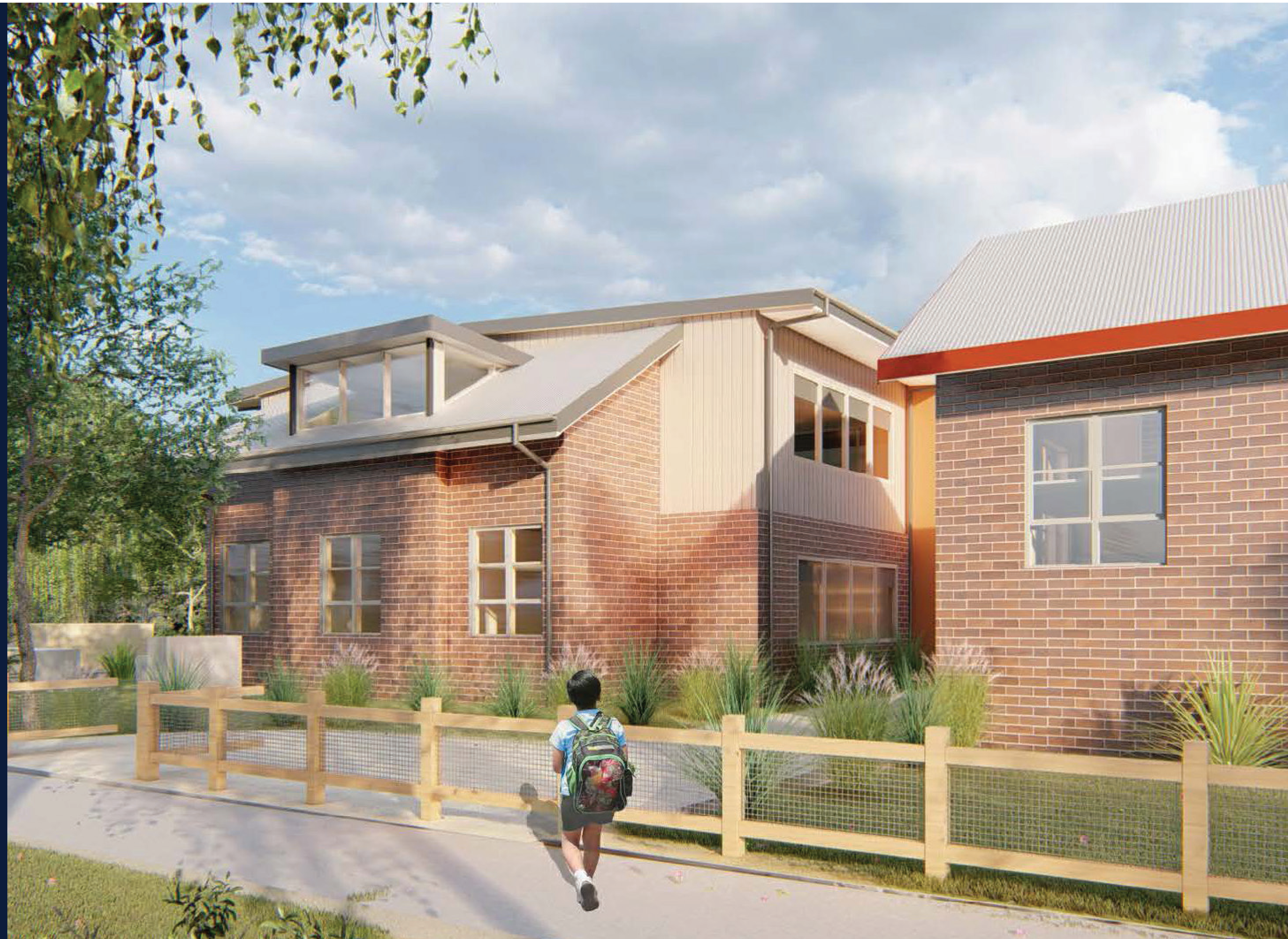
Artist impression of the heritage building and new learning hub from Park Street