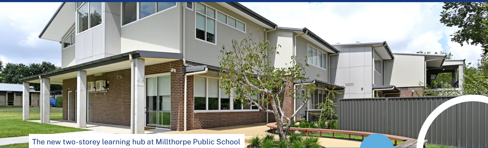
The new two-storey learning hub at Millthorpe Public School