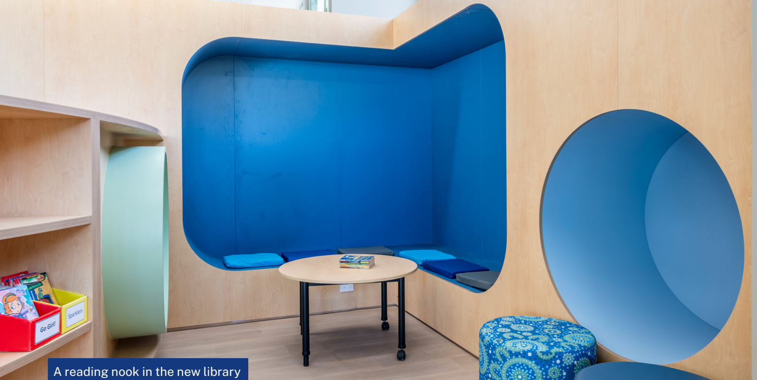
A reading nook in the new library