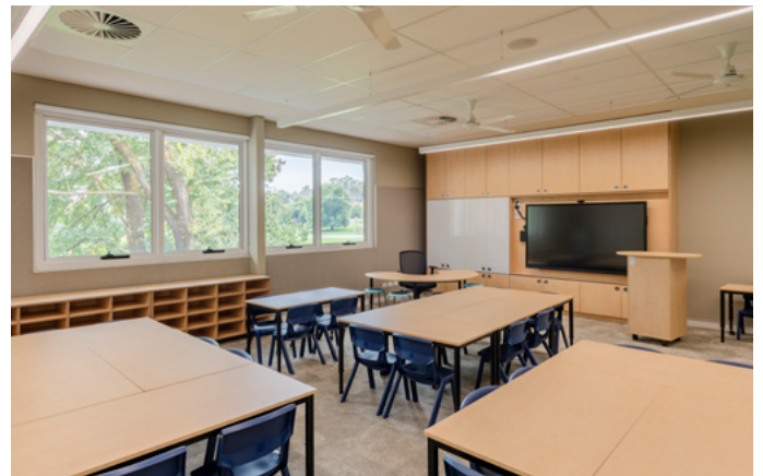
Flexible learning spaces