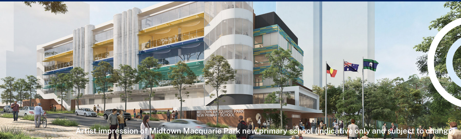
Artist impression of Midtown Macquarie Park new primary school (indicative only and subject to change)