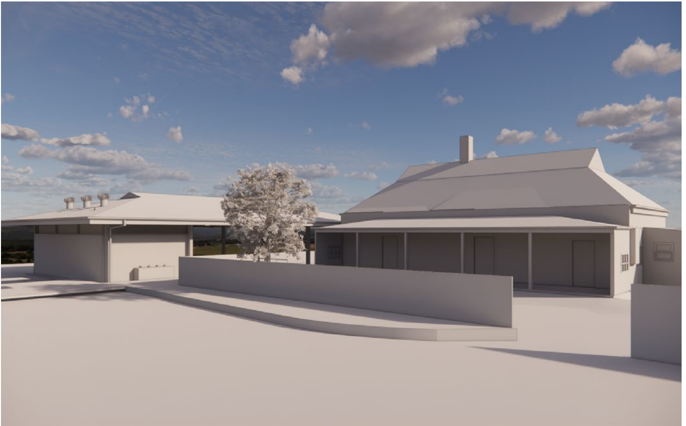
Artist impression of COLA next to Soldiers' Institute with learning area at the front and amenities block at the back