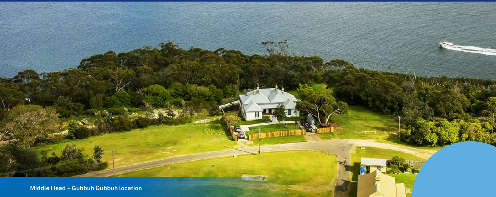
Middle Head – Gubbuh Gubbuh location