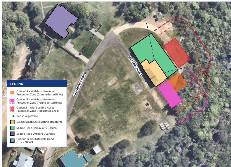
Figure 1: Proposed site locations (indicative only)

The environmental and heritage assessments carried out by Gary Puksand Pty Ltd consultants considered the potential impacts of Option 1A, Option 1B and Option 2 for the COLA (see figure 1) and the sites environmental and heritage values.