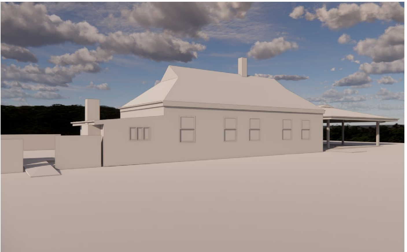
Artist impression of COLA - side view