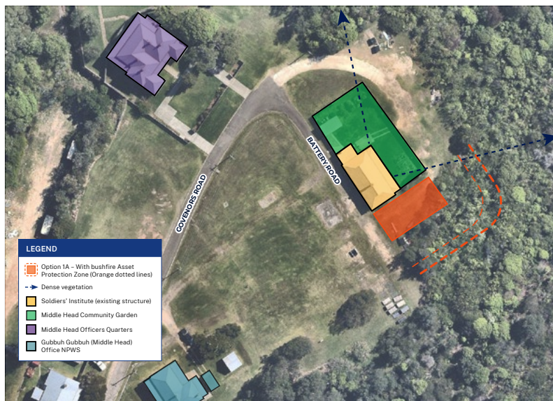
Figure 2: Preferred site location (indicative only)

The location was also found to be suitable in the environmental and heritage assessment. The assessment found that while it impacts a small area of vegetation, the construction of the COLA will not impact threatened species.