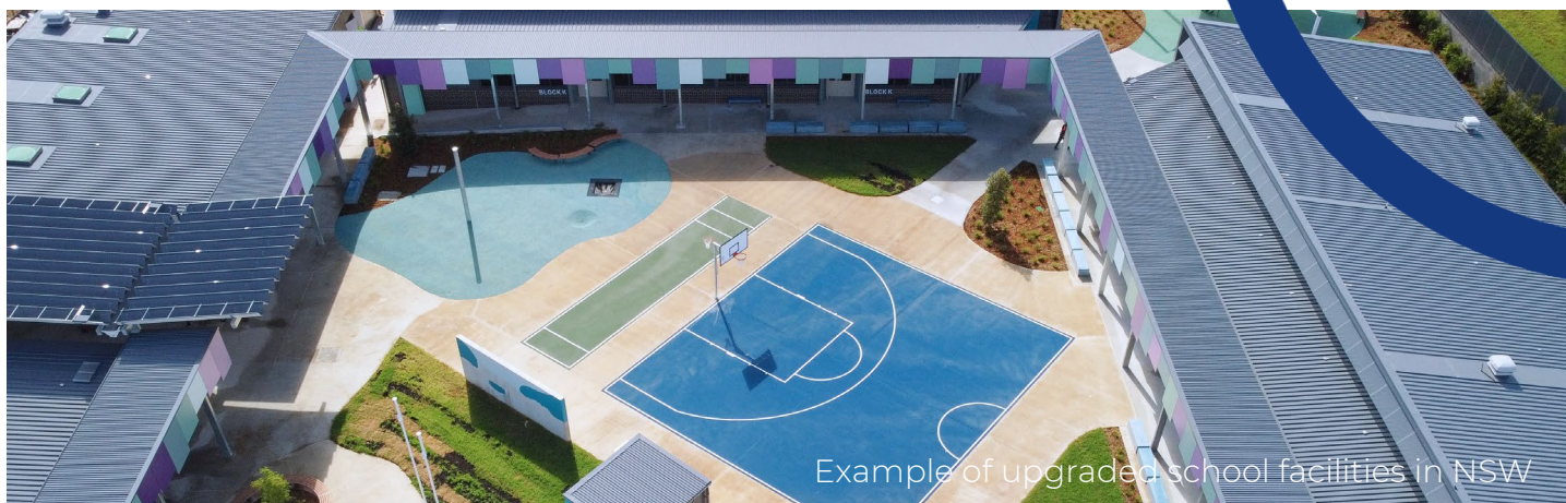
Example of upgraded school facilities in NSW