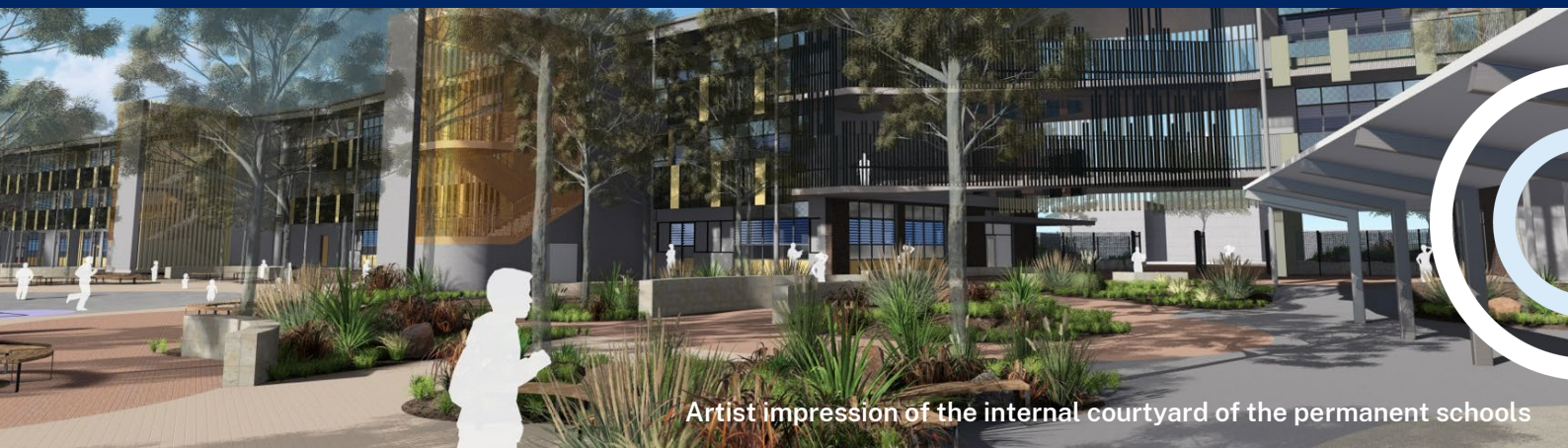
Artist impression of the internal courtyard of the permanent schools