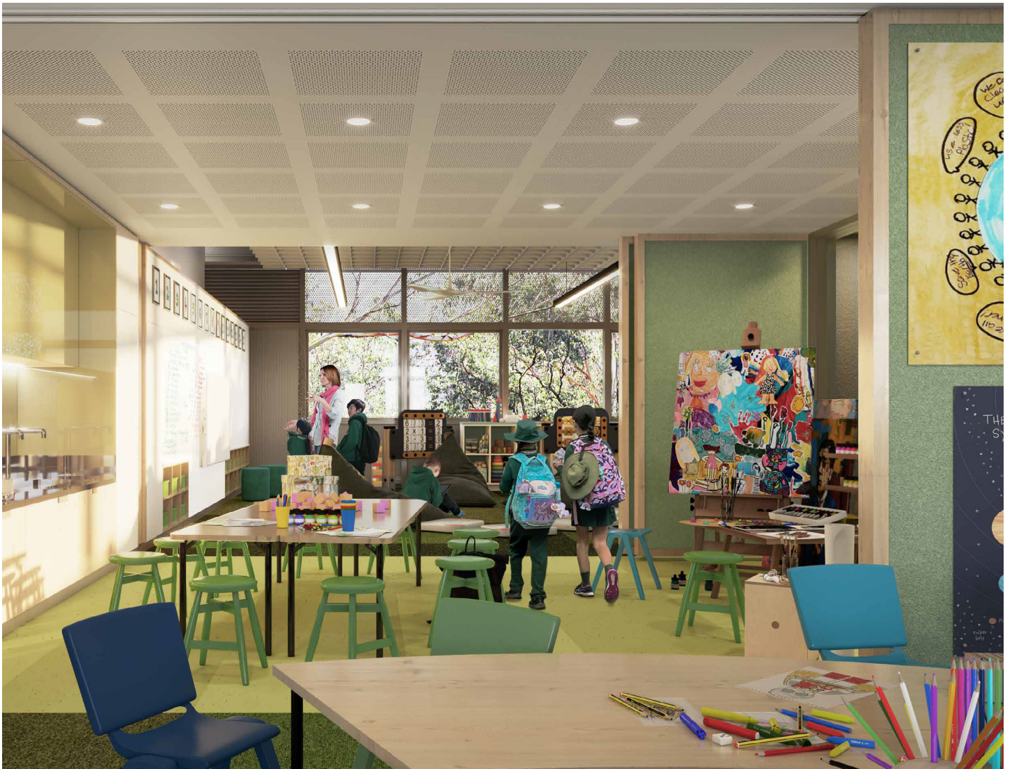
Artist impression of a flexible learning space