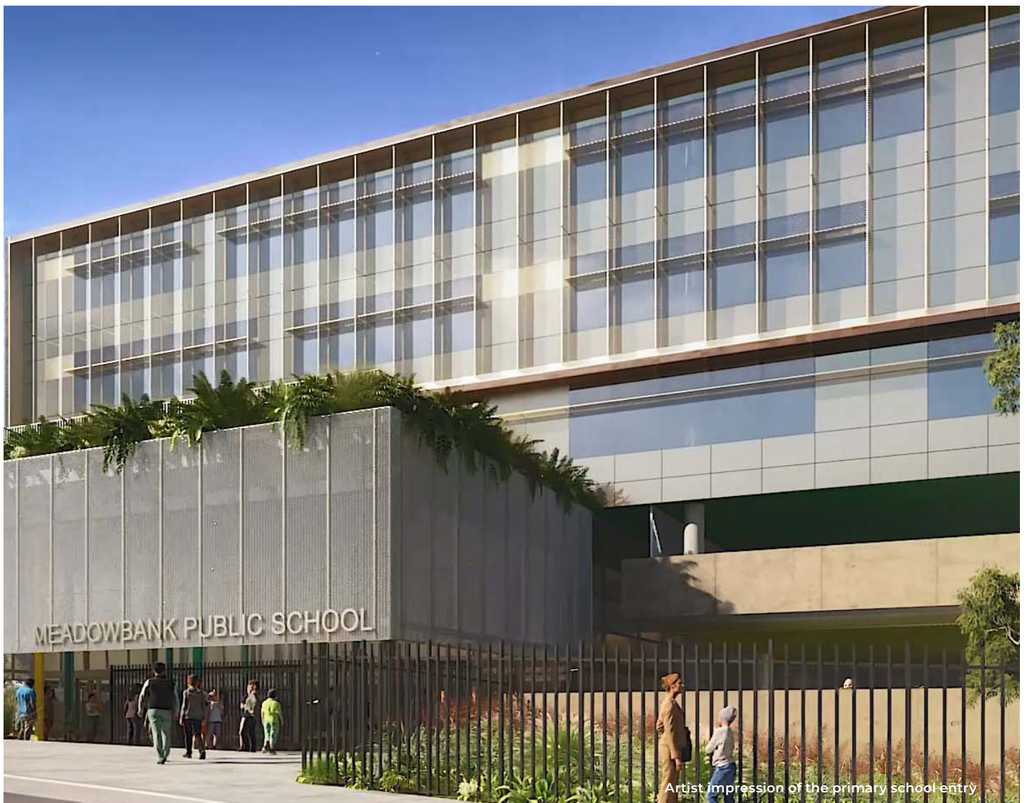
Artist impression of the primary school entry

West Ryde train station is also nearby, with morning and afternoon school buses dropping off and picking up students in the school bus zones on Rhodes and Macpherson streets.