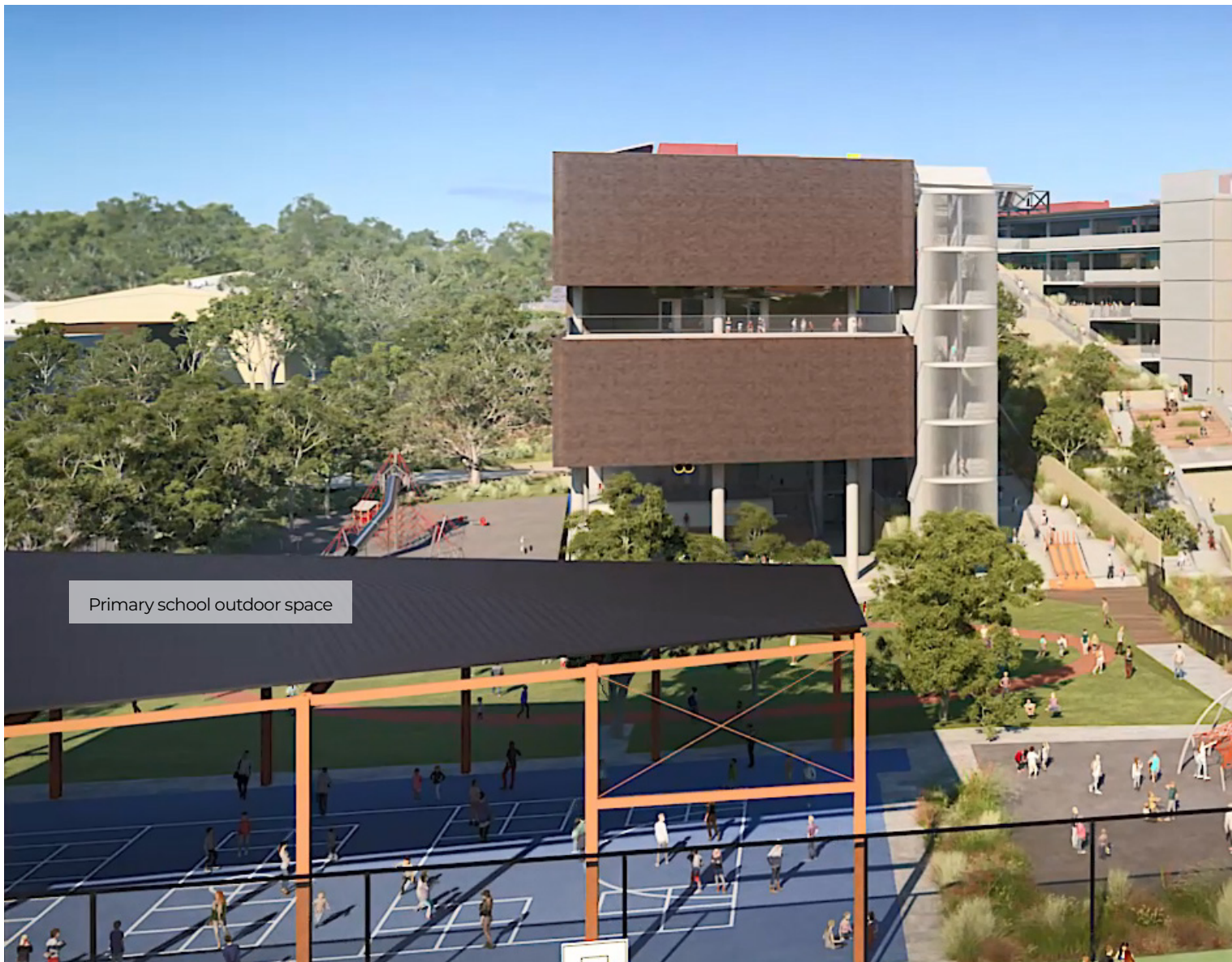
Primary school outdoor space

The uniform shop will have a dedicated space and will continue to be operated by the school at the new facilities.