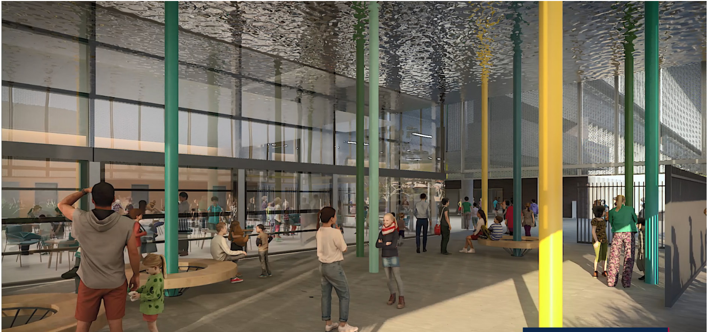
Artist impression of the primary school entry and COLA