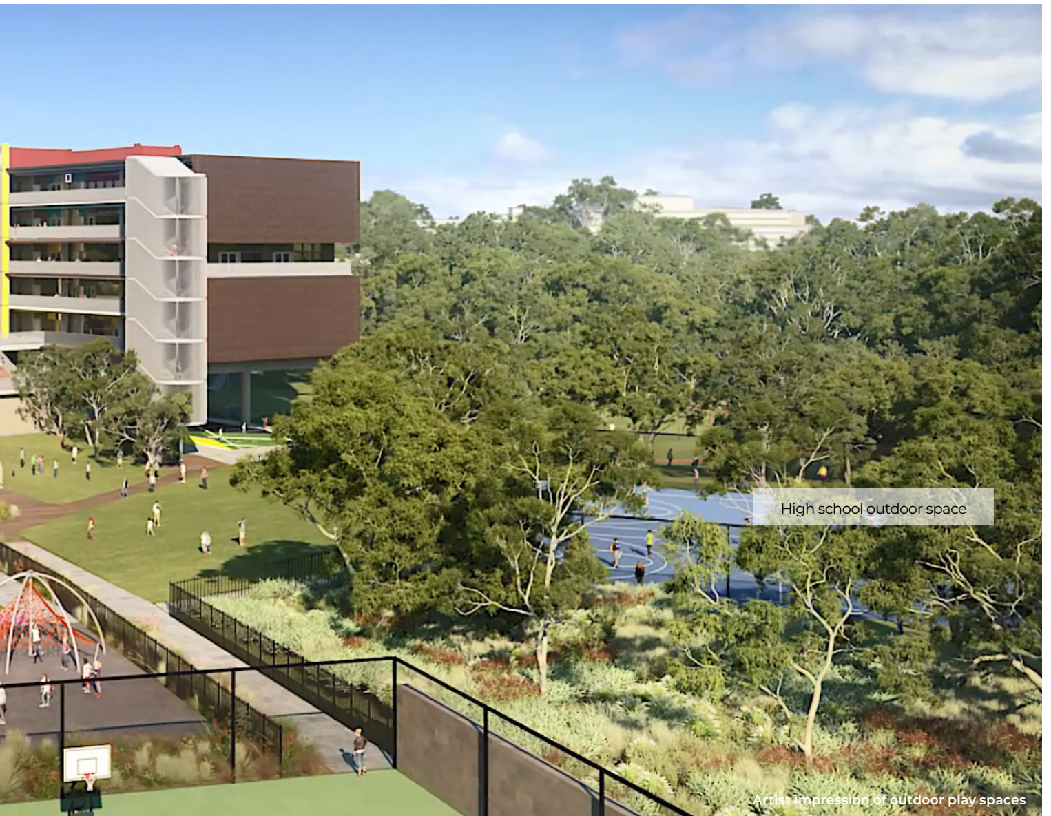
High school outdoor space