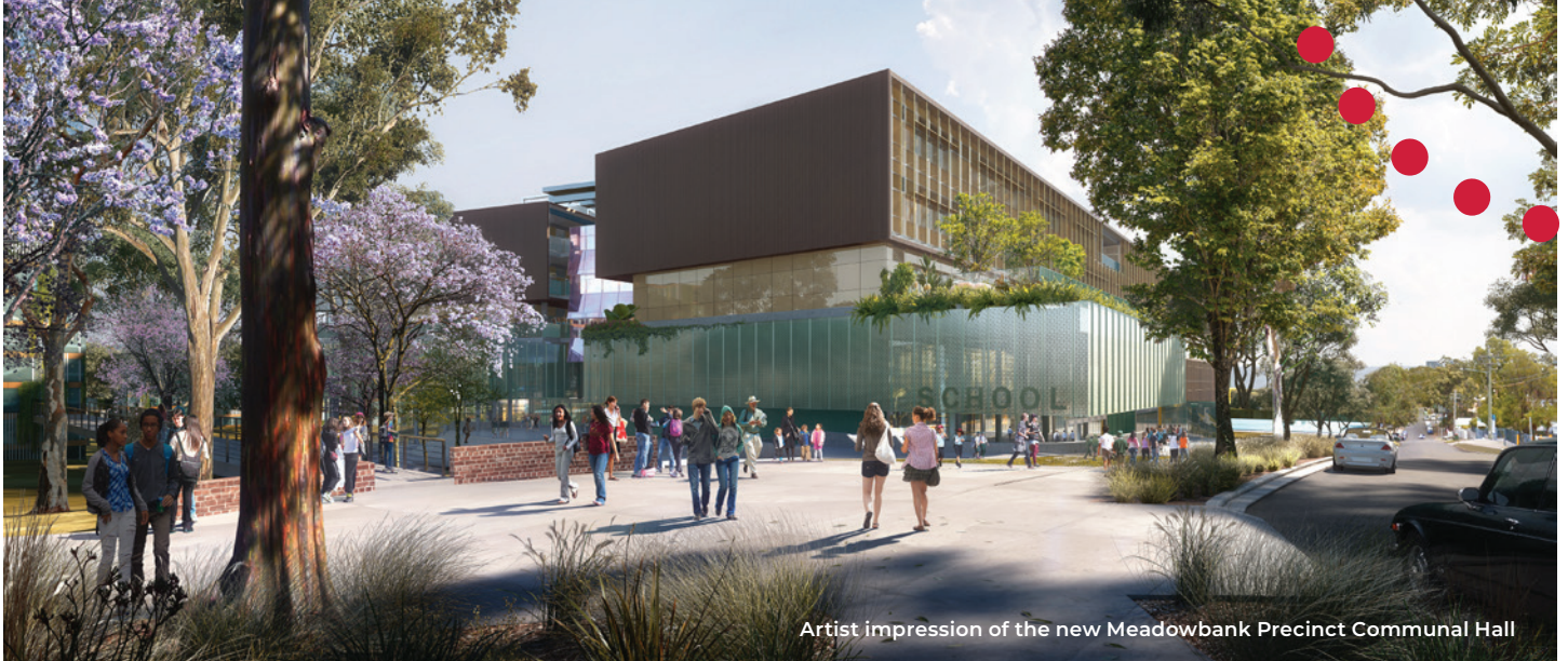
Artist impression of the new Meadowbank Precinct Communal Hall