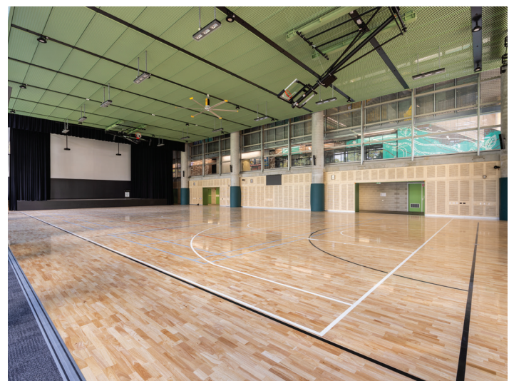
Marsden High School Gymnasium