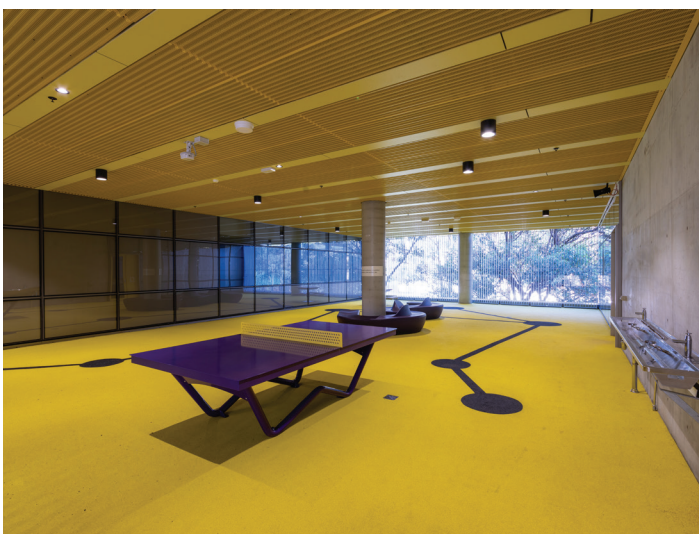
Southern Ground Level COLA

Show your friends and family what your new school looks like at: tour.lumination.com.au/meadowbank-education-precinct