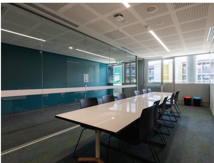
Shared Learning space Level 4 South