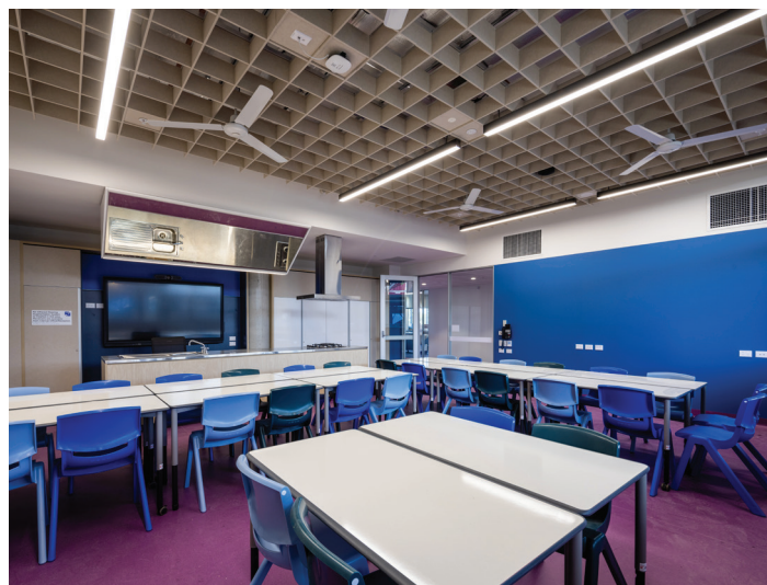
Marsden High school Demonstration kitchen Level 4 South