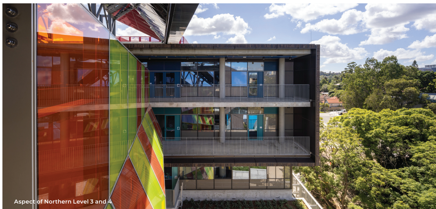
Aspect of Northern Level 3 and 4