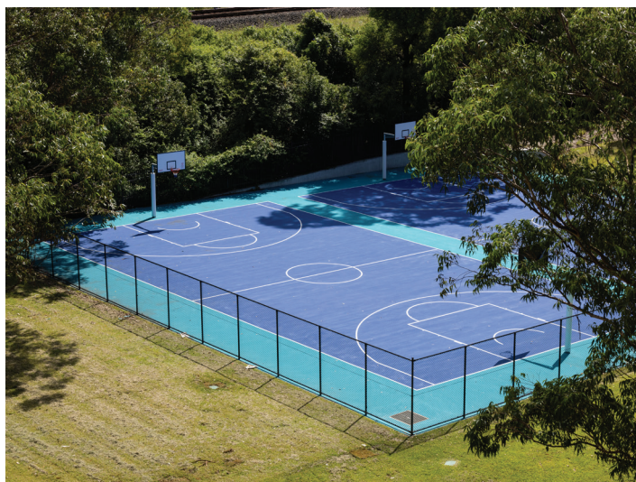
Marsden High School Basketball courts