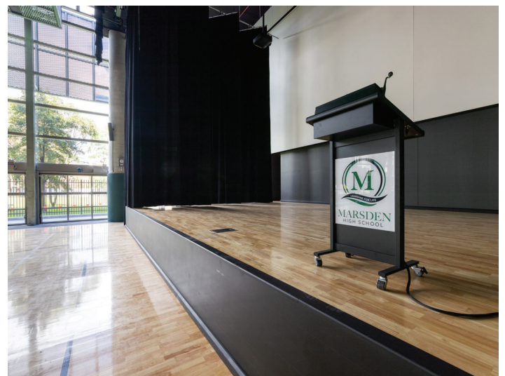
Marsden High School Lectern and school gymnasium stage