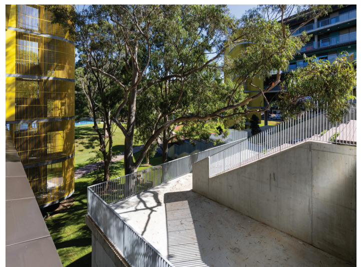
Southern Ground Level aspect of Central Spine