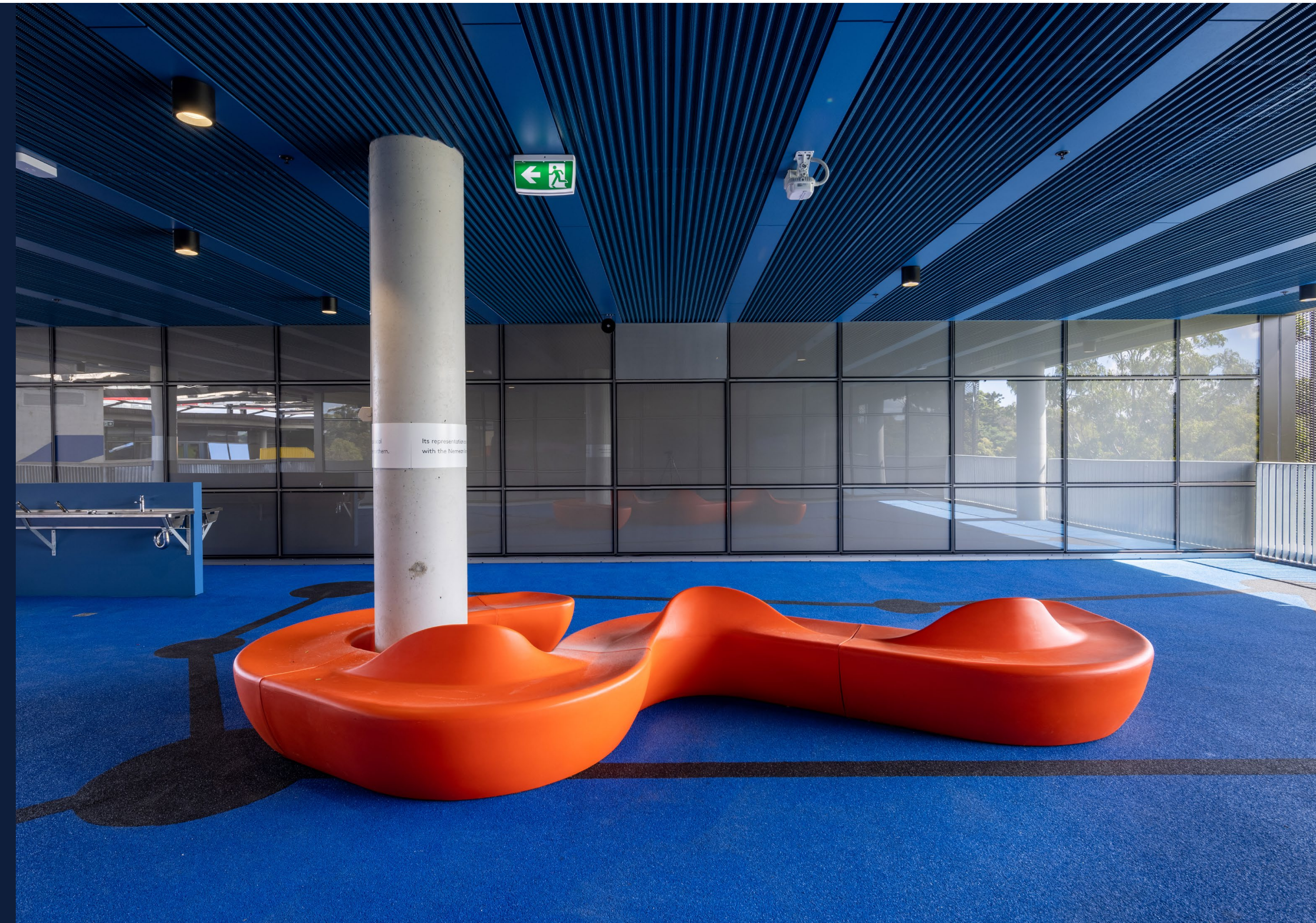
Example of a Covered Outdoor Learning Area

The Gymnasium is a state of the art facility that supports multifaceted use from multiple disciplinary sporting capabilities with retractable electronic score boards, triple height ceilings, capacity for