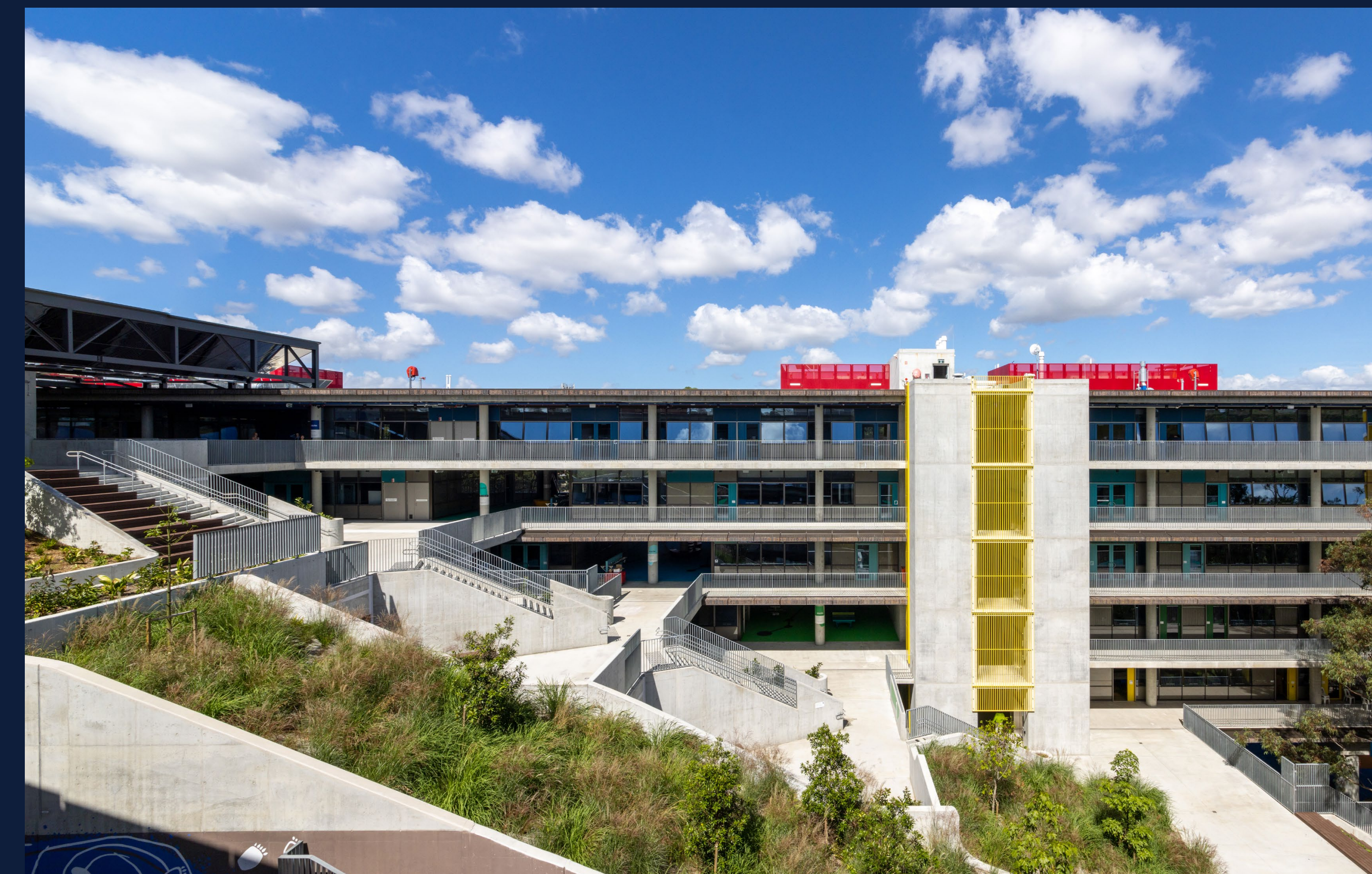
Central spine and school exterior

The new location also provides opportunities to work alongside Meadowbank Primary School and build a relationship that supports students as they progress from Kindergarten through to Year 12.