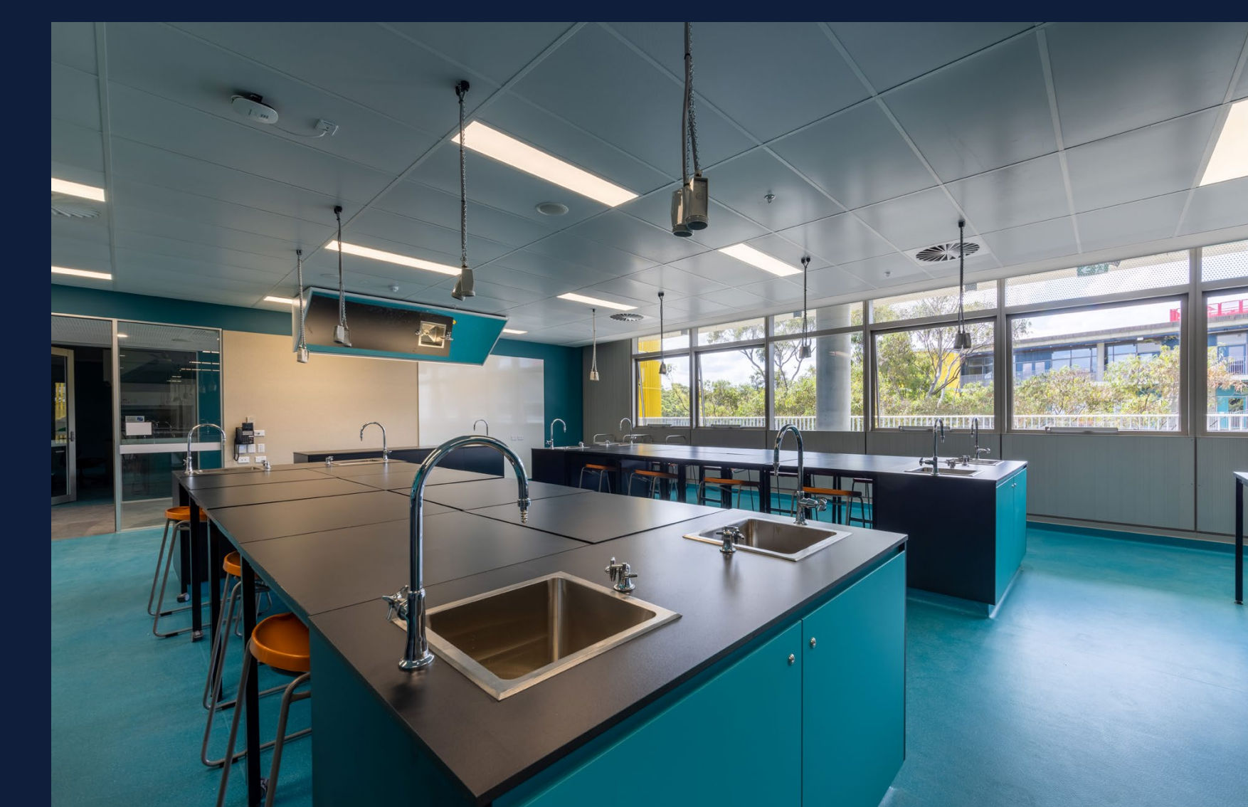
Example of a science room