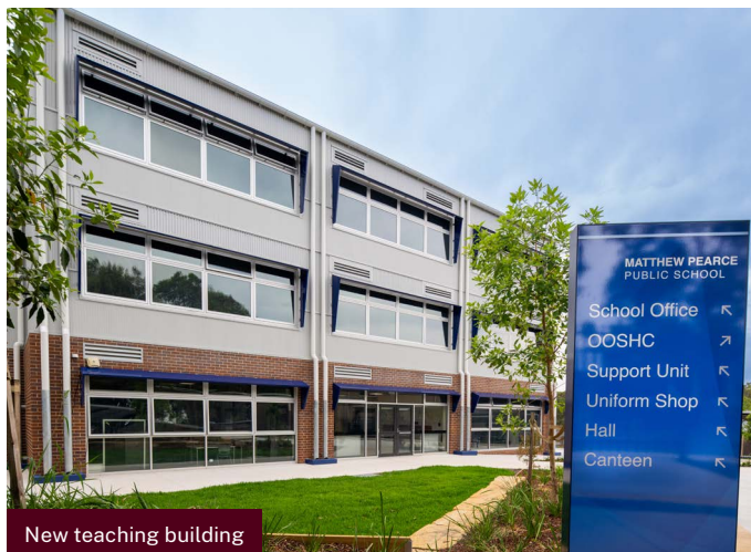
New teaching building