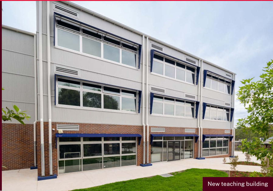
New teaching building