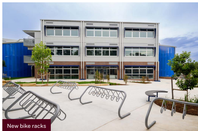
New bike racks