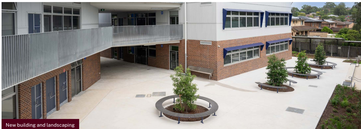
New building and landscaping