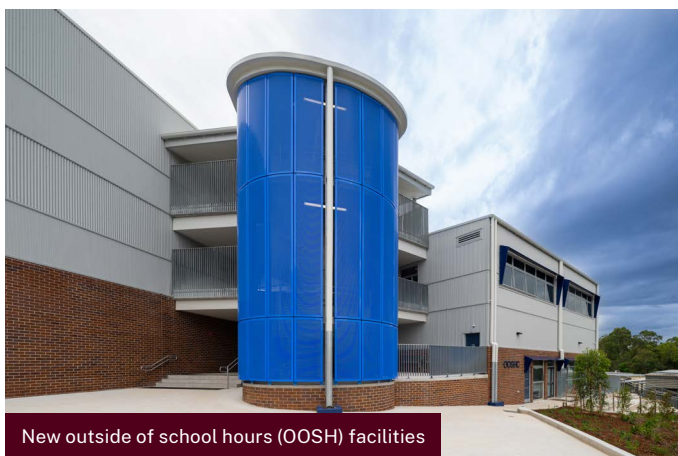
New outside of school hours (OOSH) facilities