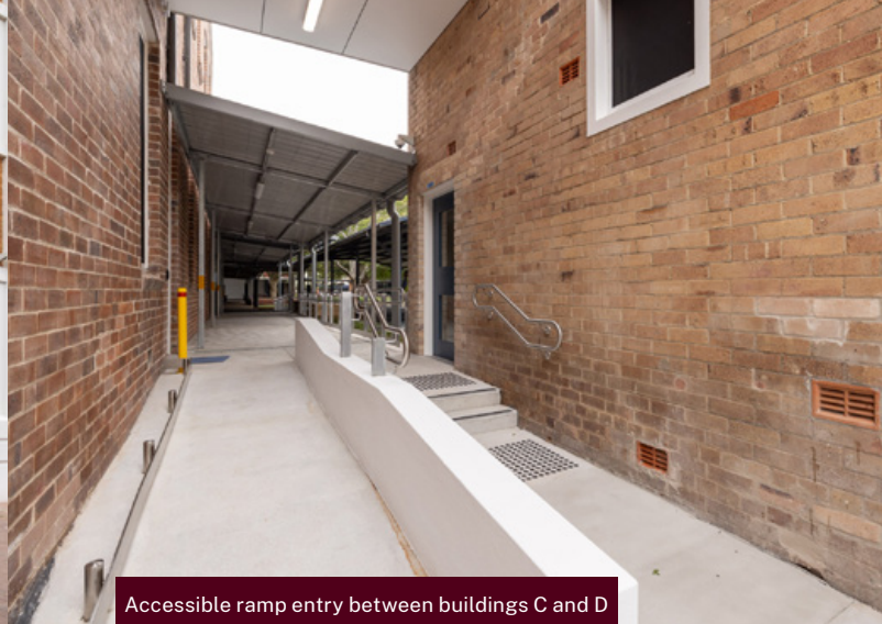
Accessible ramp entry between buildings C and D