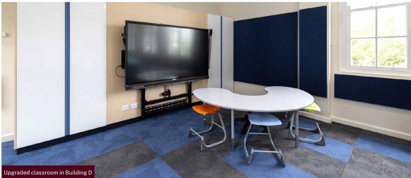
Upgraded classroom in Building D