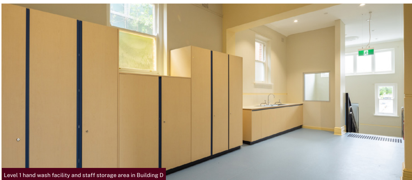
Level 1 hand wash facility and staff storage area in Building D