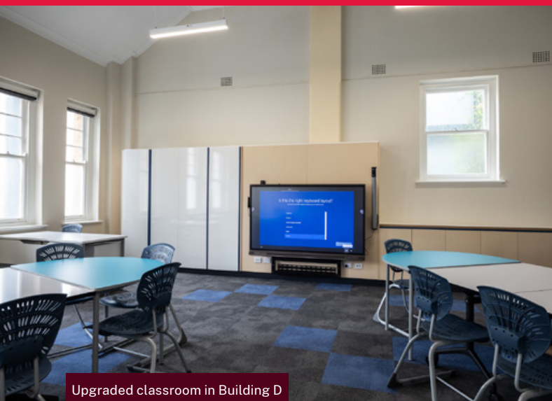
Upgraded classroom in Building D