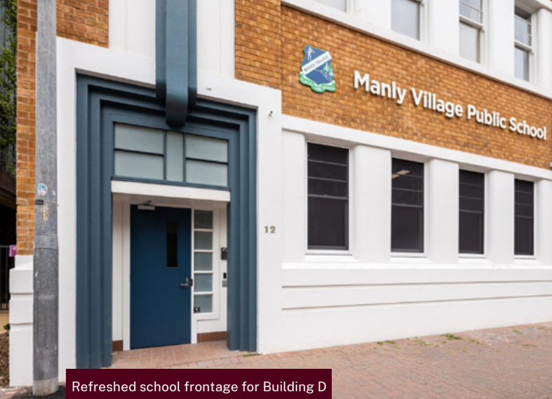
Refreshed school frontage for Building D