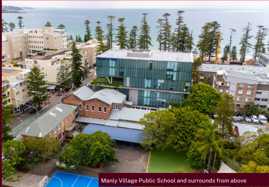
Manly Village Public School and surrounds from above