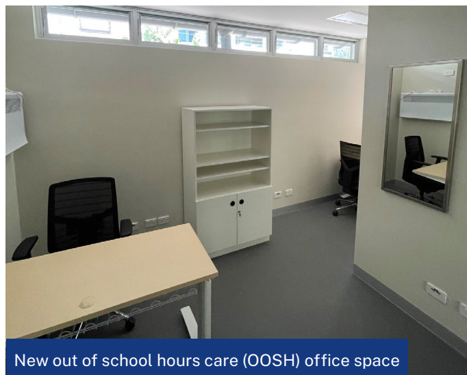
New out of school hours care (OOSH) office space