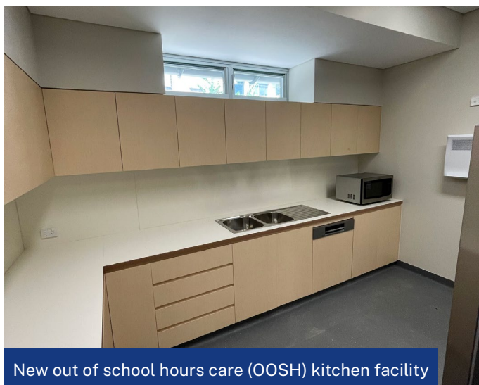
New out of school hours care (OOSH) kitchen facility