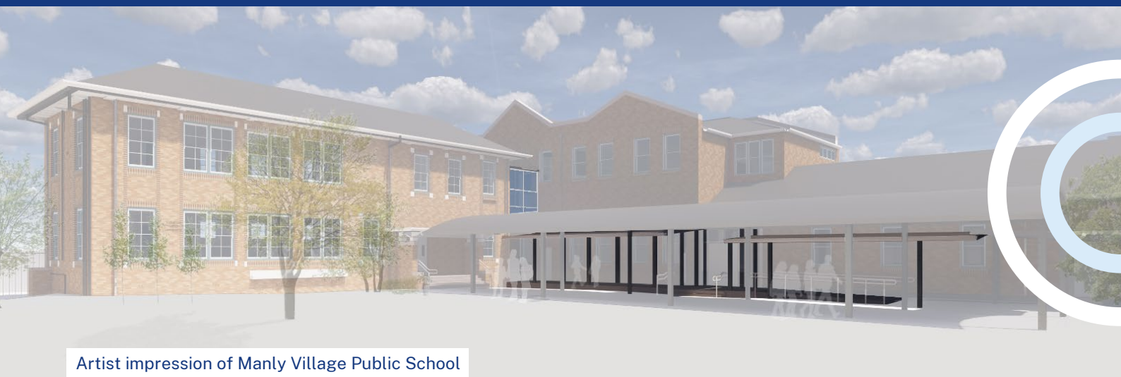
Artist impression of Manly Village Public School