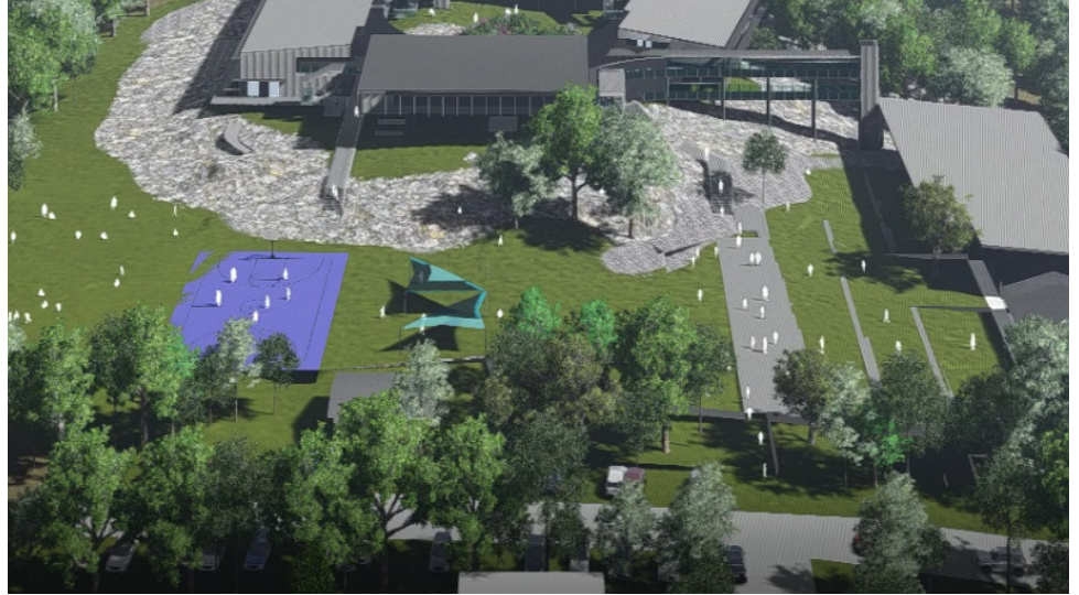
Artist's impression of completed school viewed from the east

Construction areas on the school site will be separated by temporary construction fencing, just as they have over the past year.