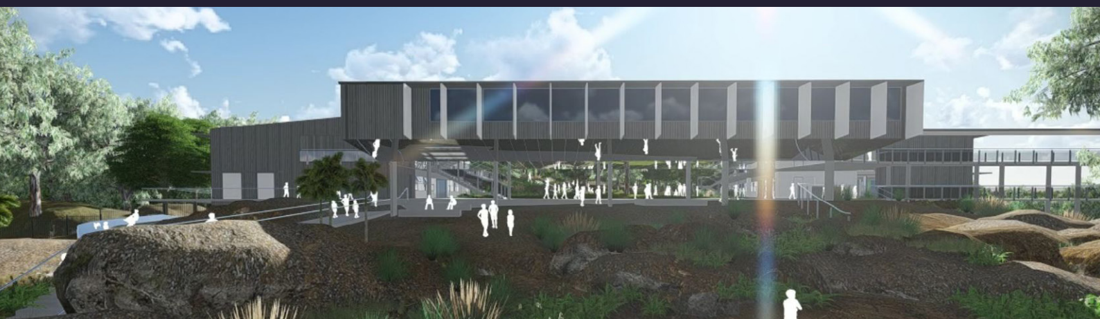
Artist's impression: eastern view of the new buildings

Manly Vale Public School is being upgraded to deliver new facilities, innovative learning spaces and provide for growing student enrolments in the area.