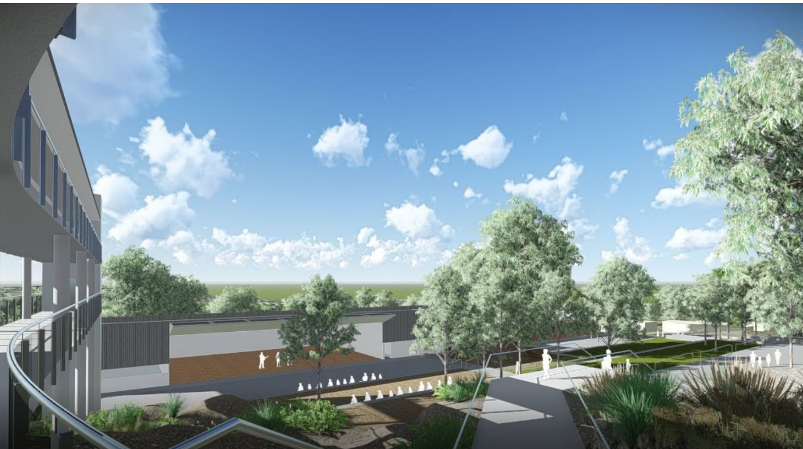
Artist's impression of north-east outlook from new buildings