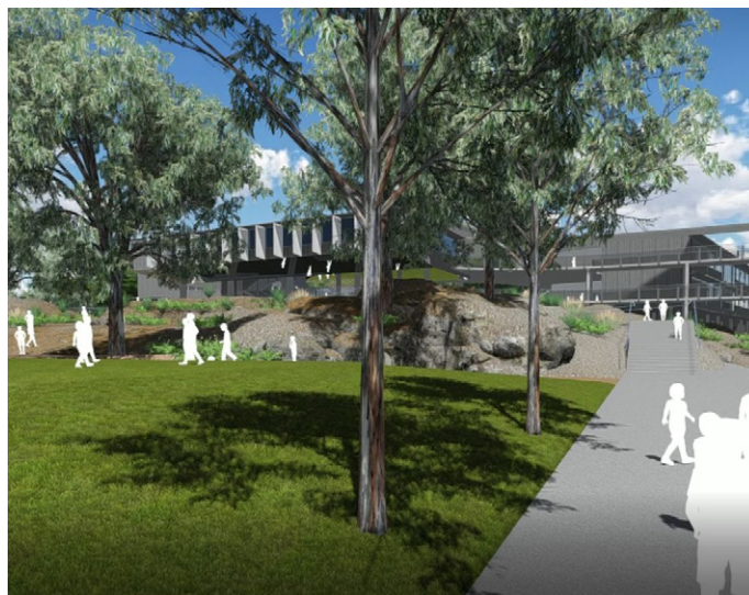
Artist's impression: view from near the corner of Sunshine and Gibbs streets