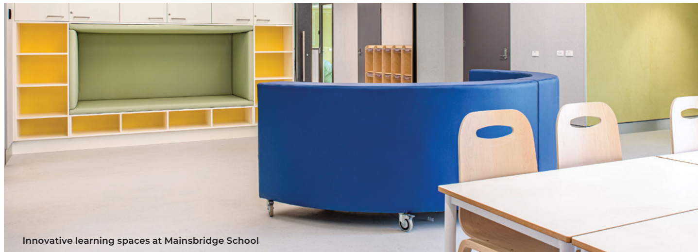
Innovative learning spaces at Mainsbridge School