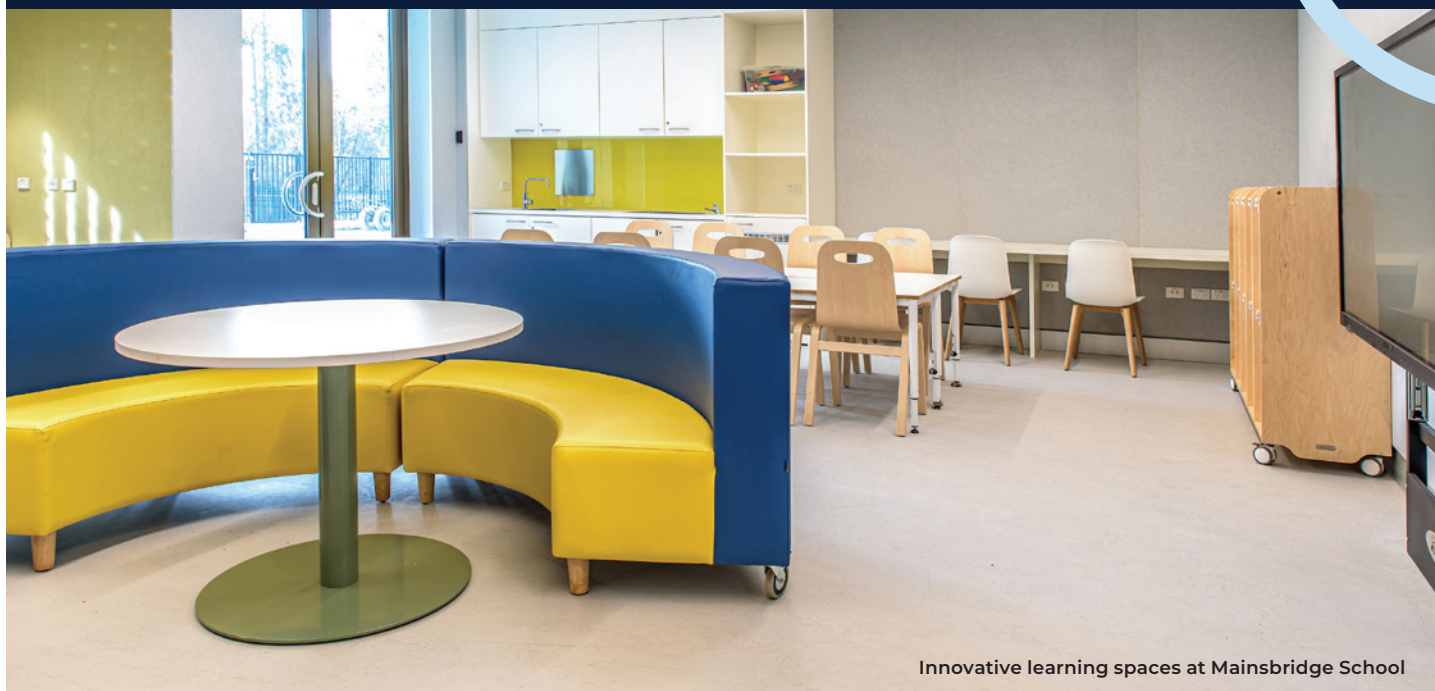
Innovative learning spaces at Mainsbridge School