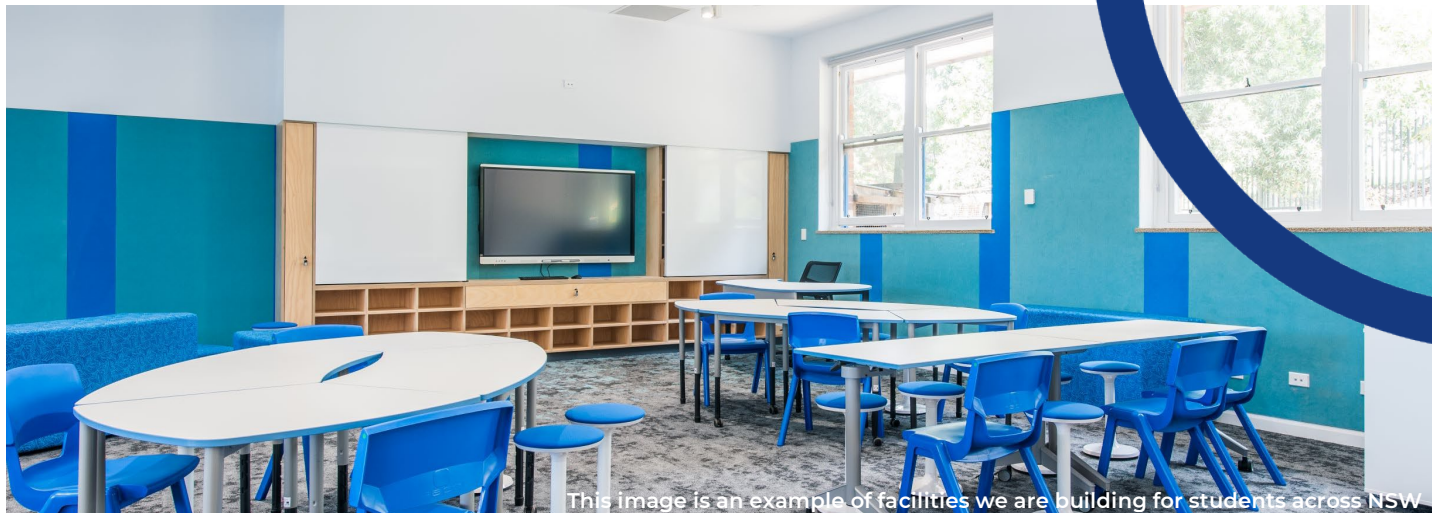
This image is an example of facilities we are building for students across NSW