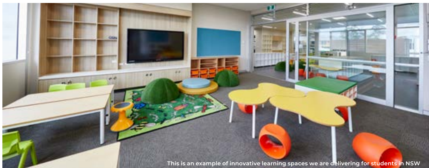
This is an example of innovative learning spaces we are delivering for students in NSW