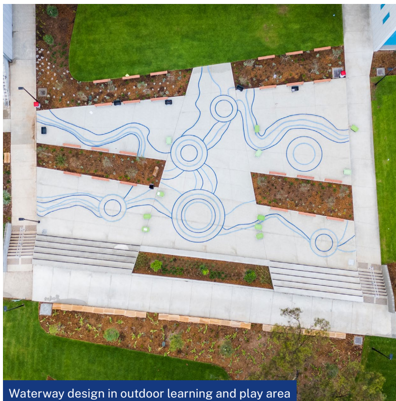
Waterway design in outdoor learning and play area