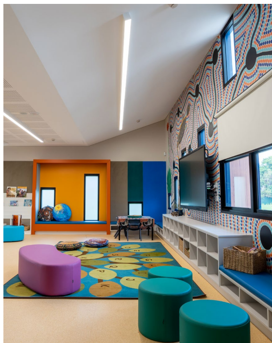
Second Coota Gulla Preschool room with mural telling the story of the GyMEA Lily and Goanna dreaming