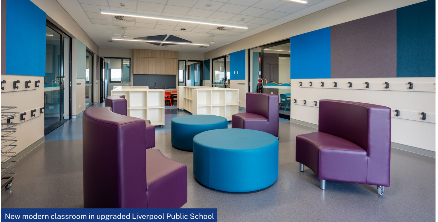
New modern classroom in upgraded Liverpool Public School

The classrooms support innovation and technology use. They are designed to work with different student group sizes and activities, such as home class groups to smaller groups and independent study. This design gives better opportunities for working together and learning adapted for individual students.