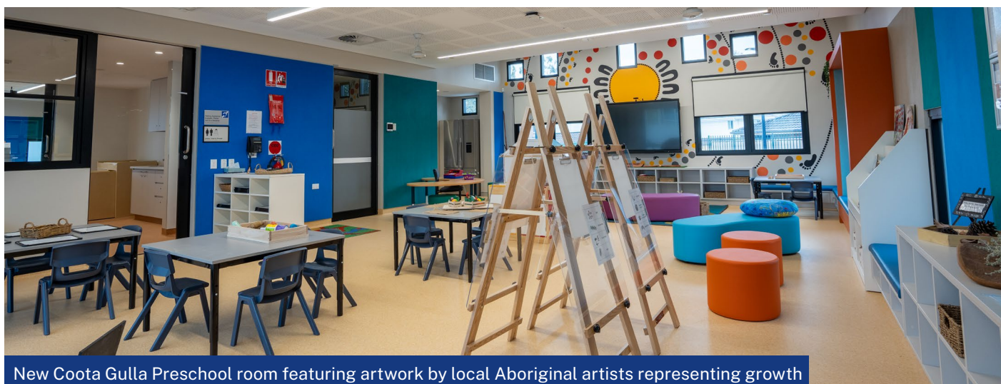
New Coota Gulla Preschool room featuring artwork by local Aboriginal artists representing growth