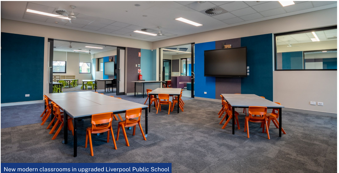
New modern classrooms in upgraded Liverpool Public School