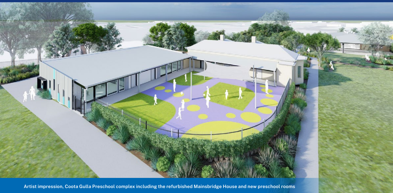
Artist impression, Coota Gulla Preschool complex including the refurbished Mainsbridge House and new preschool rooms