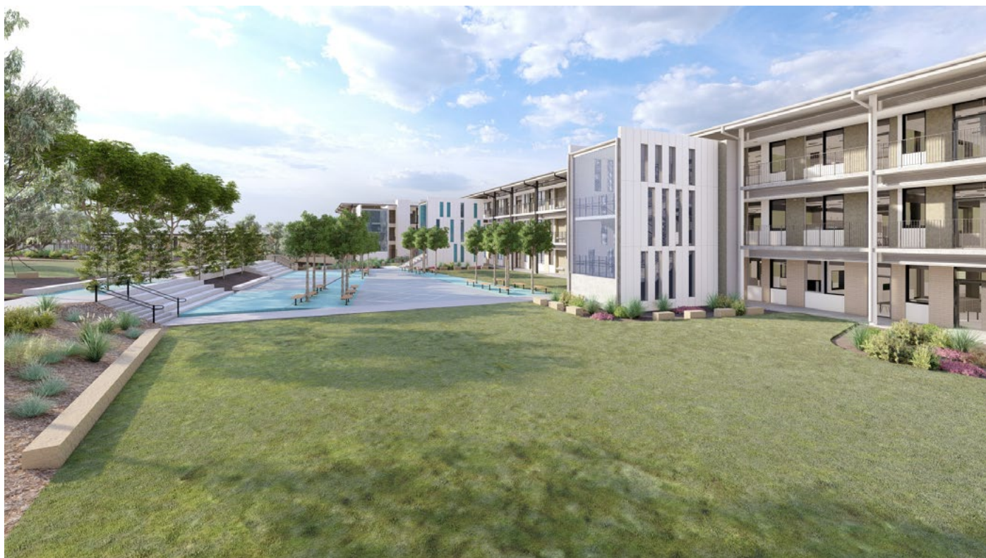
Artist impression, new landscaped play areas and homebases

The last part of this work will be to demolish the old school buildings. The contractor, ADCO, will begin this the summer school holidays and we expect it to be finished in early 2024. We will keep the community up to date on this work. See the map overleaf for the demolition area.