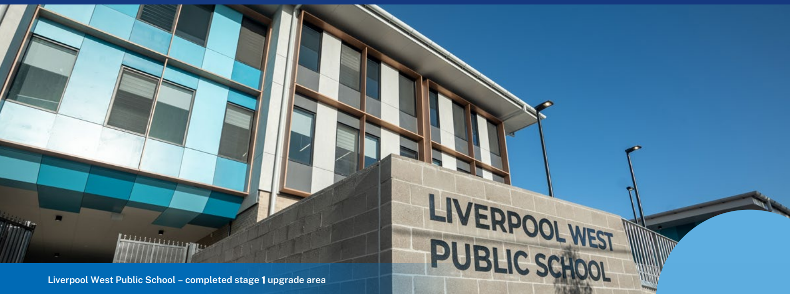
Liverpool West Public School – completed stage 1 upgrade area