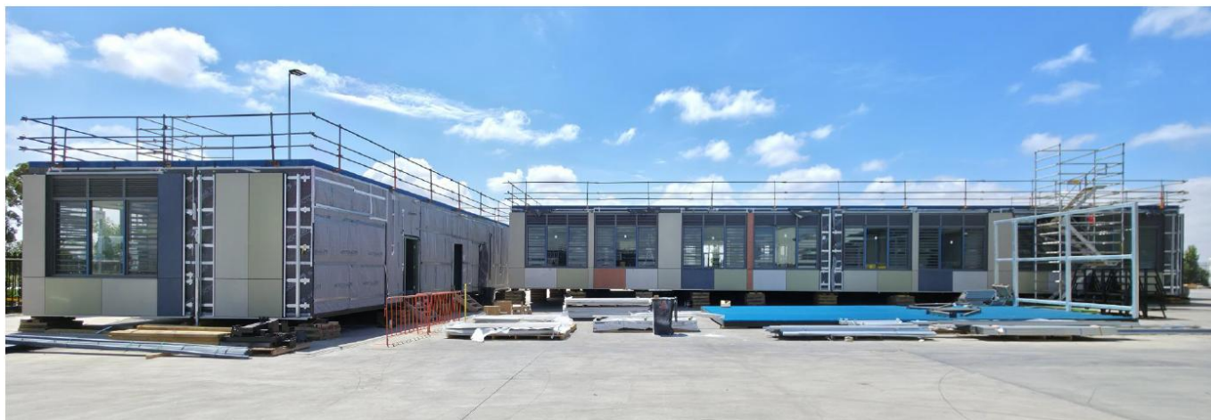
Lismore South Public School building modules