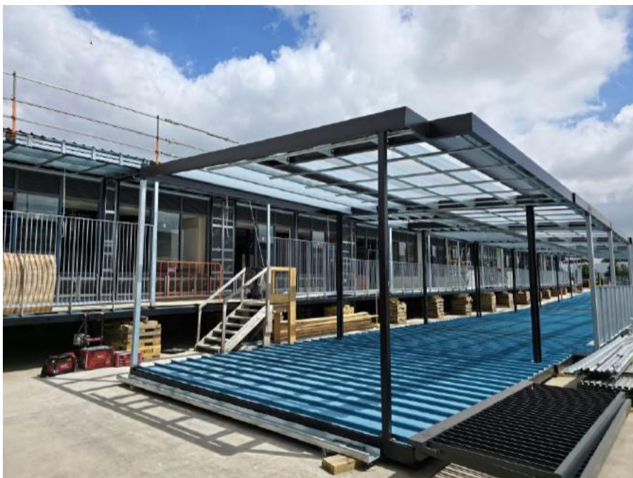
Veranda and walkway being manufactured