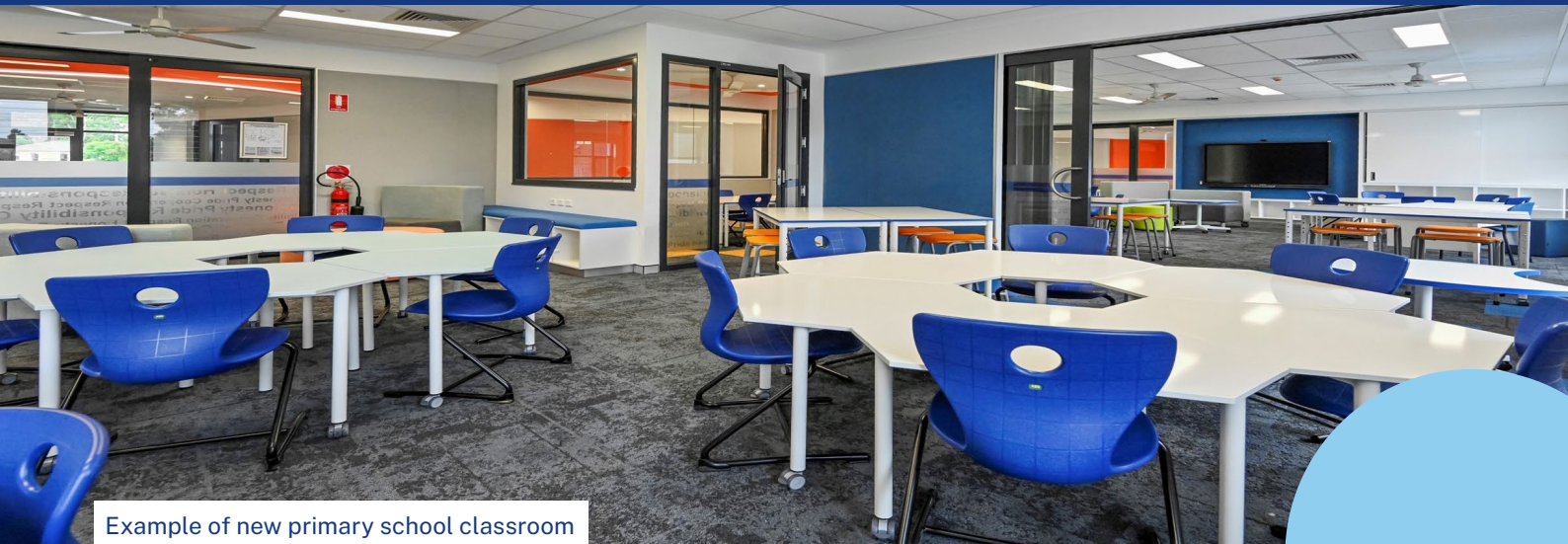
Example of new primary school classroom