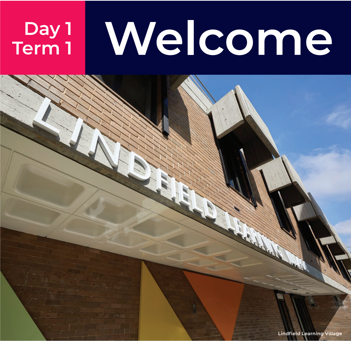
Lindfield Learning Village