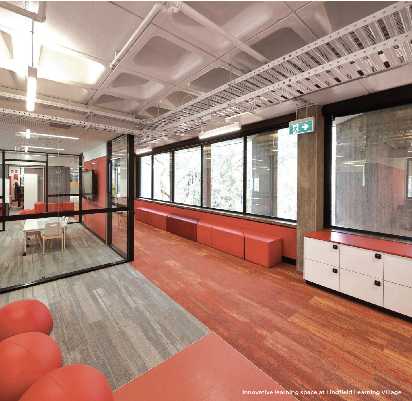
Innovative learning space at Lindfield Learning Village