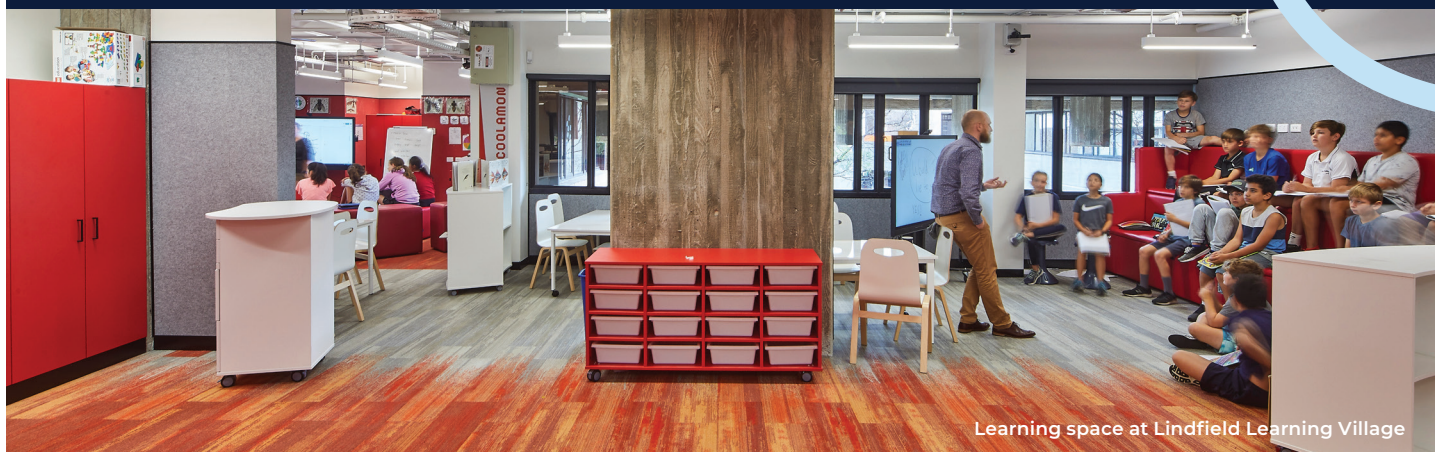
Learning space at Lindfield Learning Village