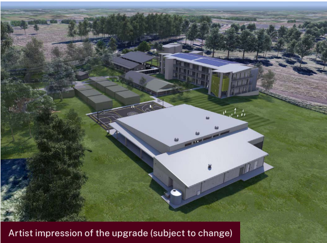
Artist impression of the upgrade (subject to change)