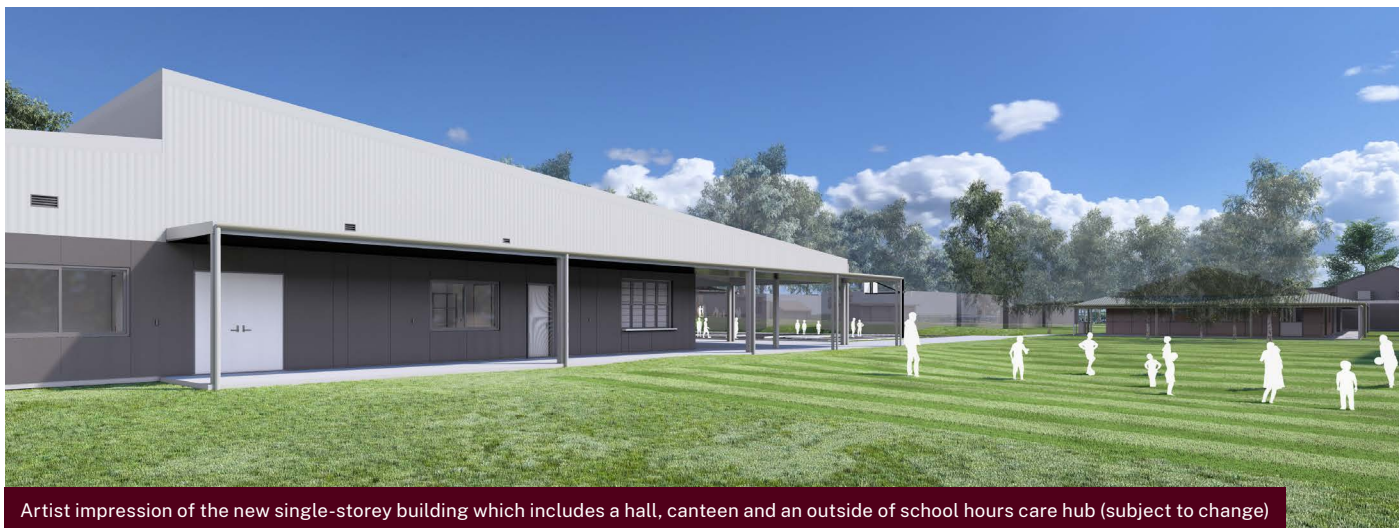
Artist impression of the new single-storey building which includes a hall, canteen and an outside of school hours care hub (subject to change)