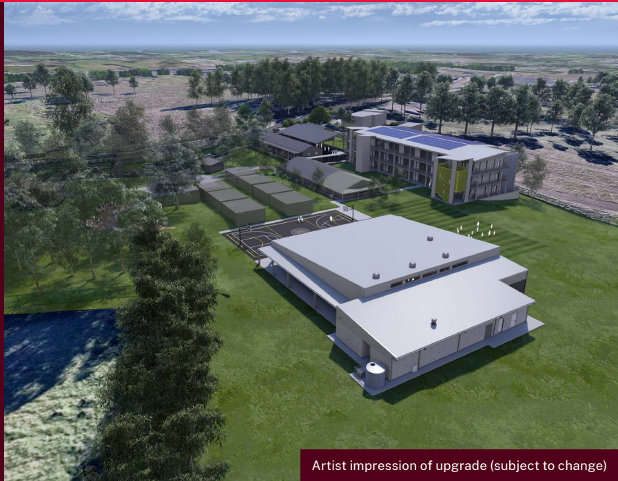
Artist impression of upgrade (subject to change)